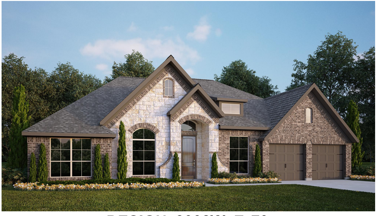
DESIGN 3002W E-70

*See Page 3 for Details and Disclaimers | © Perry Homes, LLC 2023 | 6/29/2023 1:11:55 PM (70' CL) PerryHomes.com