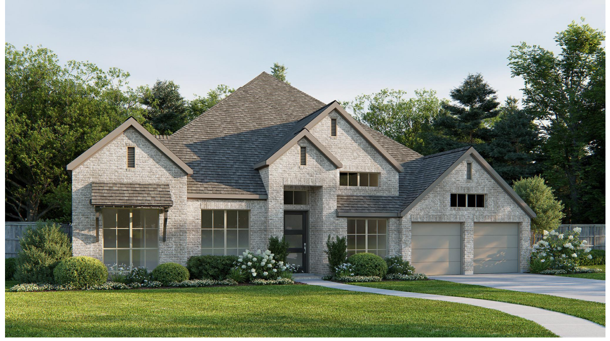
DESIGN 3002W E-1