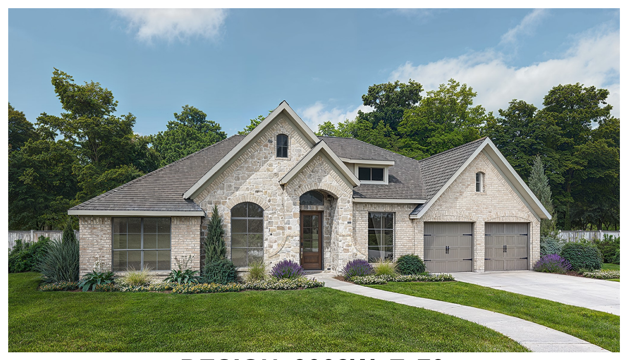
DESIGN 3002W E-70