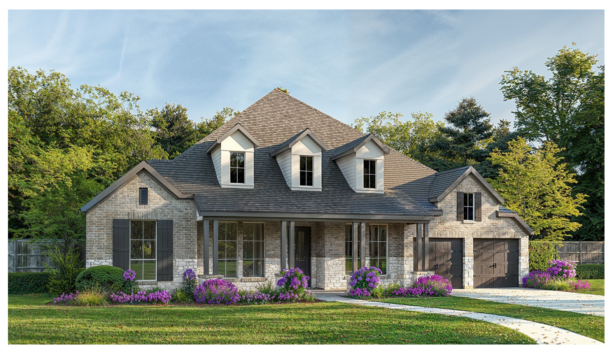
DESIGN 3002W E-102 This elevation includes large front porch.

This design, as originally designed and prior to any changes you make, is estimated to yield approximately the number of square feet shown on page 1. All dimensions are approximate. Square footage may are passed on as-built dimensions, configurations, plan options and/or the method of calculation. Designs are not-to-scale, and are conceptual illustrations that may differ from construction plans or completed improvements. A design may depict features not available on all homesites or in all communities. Perry Homes reserves the right to make changes in plans and specifications, and to substitute material similar quality. Prices, terms, promotions, plans, dimensions, features, options, amenities, elevations, designs, square footages, specifications, materials, and availability of homes or communities are subject to change without notice or obligation. All obligations will be governed by a written contract. This design does not constitute a commitment to build a particular floor plan or home in any given community. Some floor plans, options, and/or elevations may not be available on certain homesites or in a particular community and may require additional charges. Please check with Perry Homes to verify current offerings in the communities you are considering. This rendering is the property of Perry Homes, LLC. Any reproduction or exhibition is strictly prohibited. © Perry Homes, LLC 2005.