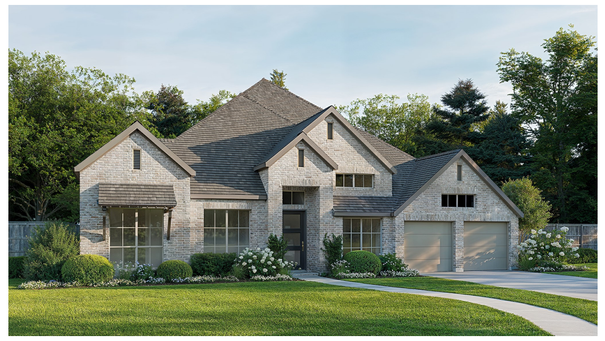
DESIGN 3002W E-1