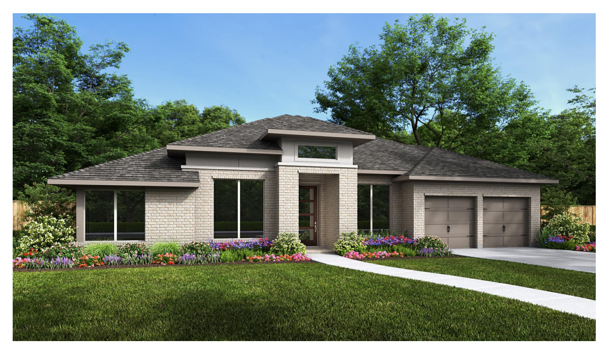
DESIGN 3002W E-33