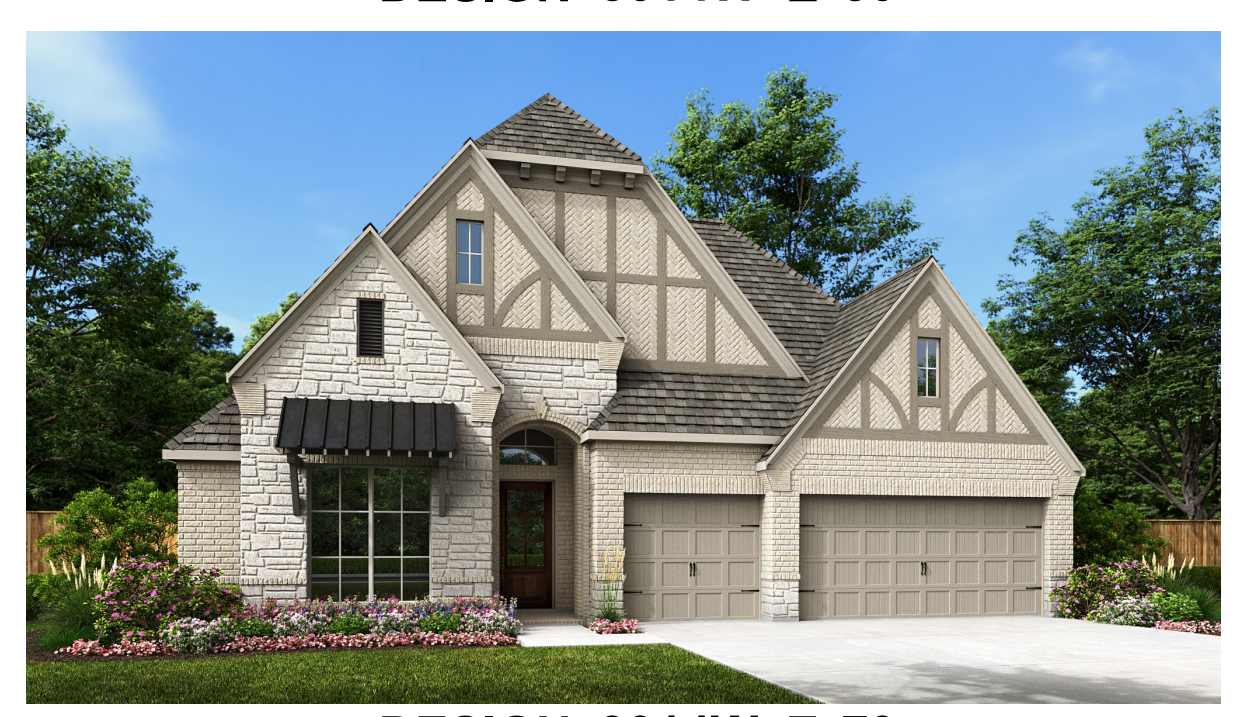
DESIGN 3014W E-70

This design, as originally designed and prior to any changes you make, is estimated to yield approximately the number of square feet shown on page 1. All dimensions are approximate. Square footage may vary based on as-built dimensions, configurations, plan options and/or the method of calculation. Designs are not-to-scale, and are conceptual illustrations that may differ from construction plans or completed improvements. A design may depict features not available on all homesites or in all communities. Perry Homes reserves the right to make changes in plans and specifications, and to substitute material of similar quality. Prices, terms, promotions, plans, dimensions, features, options, amenities, elevations, designs, square footages, specifications, materials, and availability of homes or communities to change without notice or obligation. All obligations will be governed by a written contract. This design does not constitute a commitment to build a particular floor plan or home in any given community. Some floor plans, options, and/or elevations may not be available on certain homesites or in a particular community and may require additional charges. Please check with Perry Homes to verify current offerings in the communities and are considering. This rendering is the property of Perry Homes. LLC. Any reproduction or exhibition is strictly prohibited @ Perry Homes LLC. 2019.