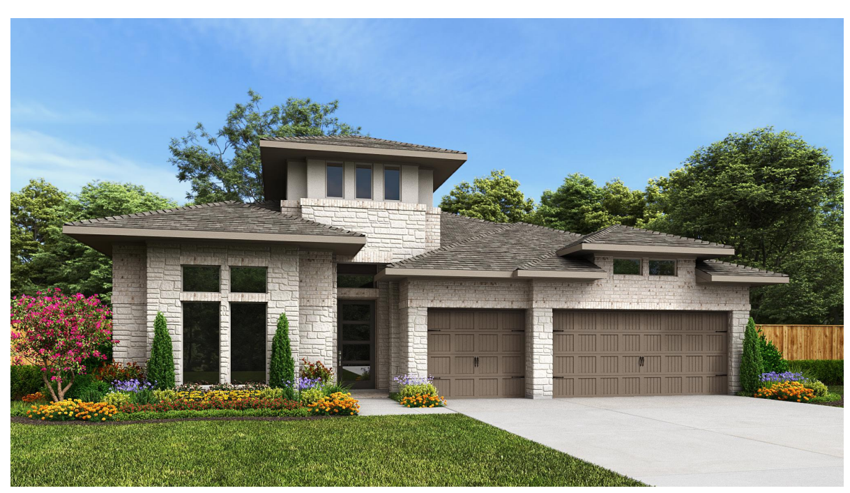
DESIGN 3014W E-50