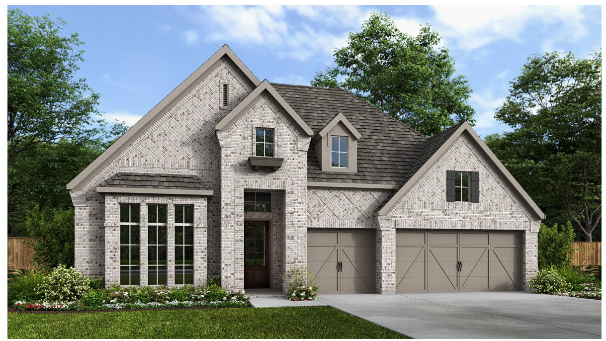
DESIGN 3014W E-1