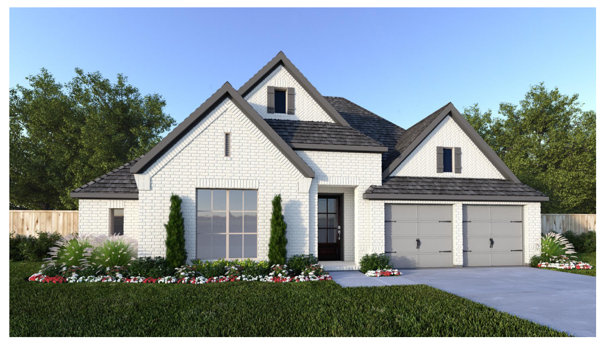
DESIGN 3031W E-1