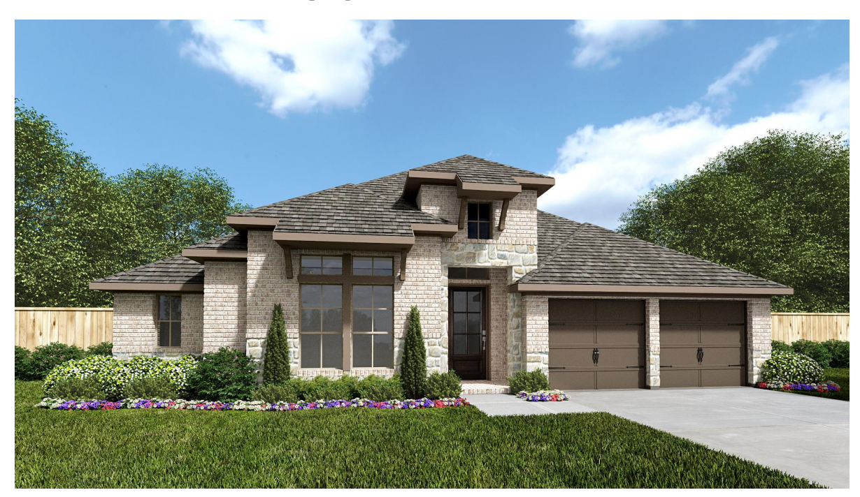
DESIGN 3031W E-30