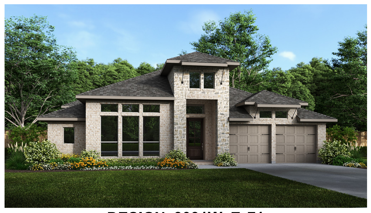
DESIGN 3031W E-71

This design, as originally designed and prior to any changes you make, is estimated to yield approximately the number of square feet shown on page 1. All dimensions are approximate. Square footage may vary based on as-built dimensions, configurations, plan options and/or the method of calculation. Designs are not-to-scale, and are conceptual illustrations that may differ from construction plans or completed improvements. A design may depict features not available on all homesites or in all communities. Perry Homes reserves the right to make changes in plans and specifications, and to substitute material of similar quality. Prices, terms, promotions, plans, dimensions, features, options, amenities, elevations, designs, square footages, specifications, materials, and availability of homes or communities are subject to change without notice or obligation. All obligations will be governed by a written contract. This design does not constitute a commitment to build a particular floor plan or home in any given community Some floor plans, options, and/or elevations may not be available on certain homesites or in a particular community and may require additional charges. Please check with Perry Homes to verify current offerings in the communities are considering. This rendering is the property of Perry Homes 11 C. Any reproduction or exhibition is strictly prohibited @ Perry Homes 11 C. 2023