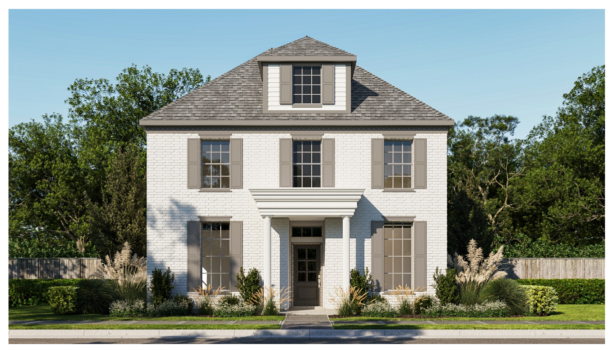
DESIGN 3047T E-2