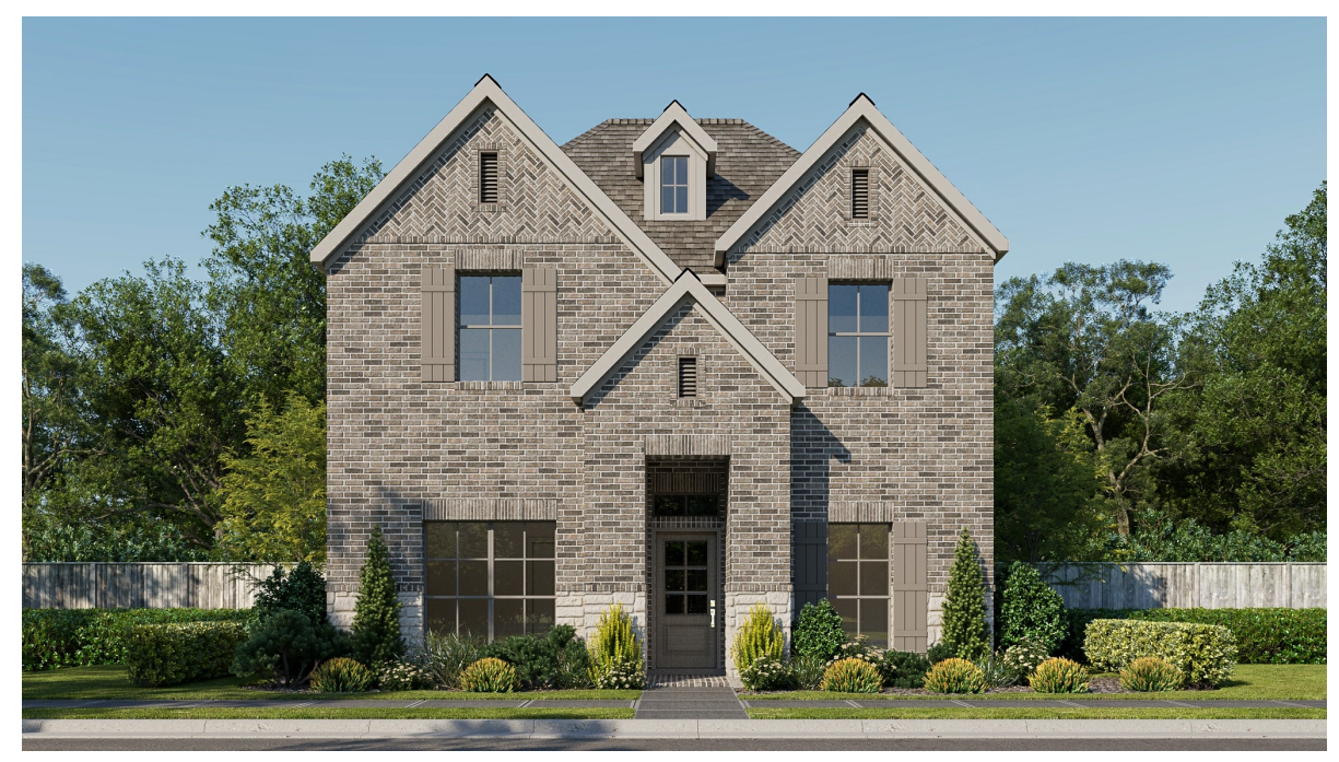
DESIGN 3047T E-1