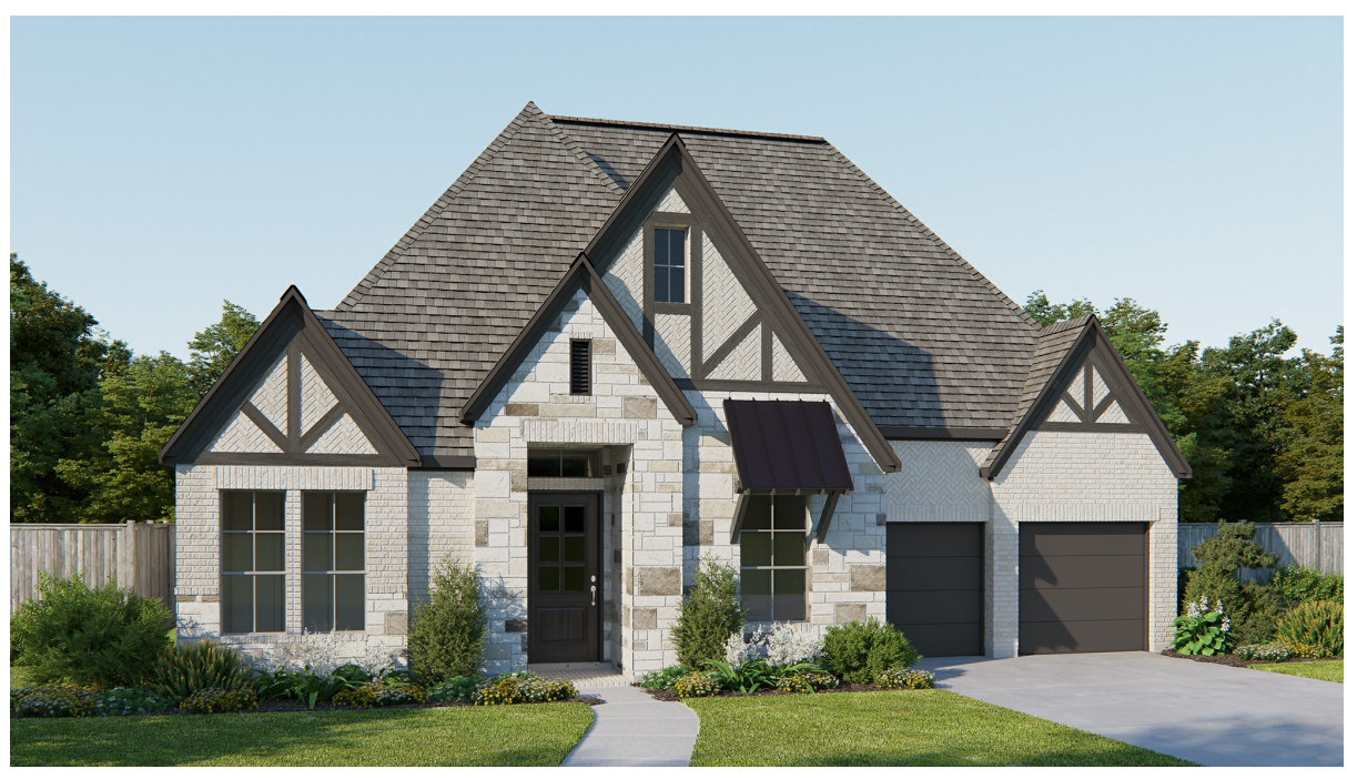
DESIGN 3080W E-70