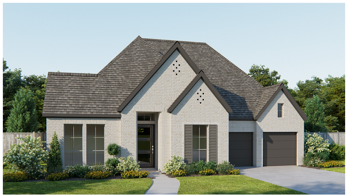
DESIGN 3080W E-1