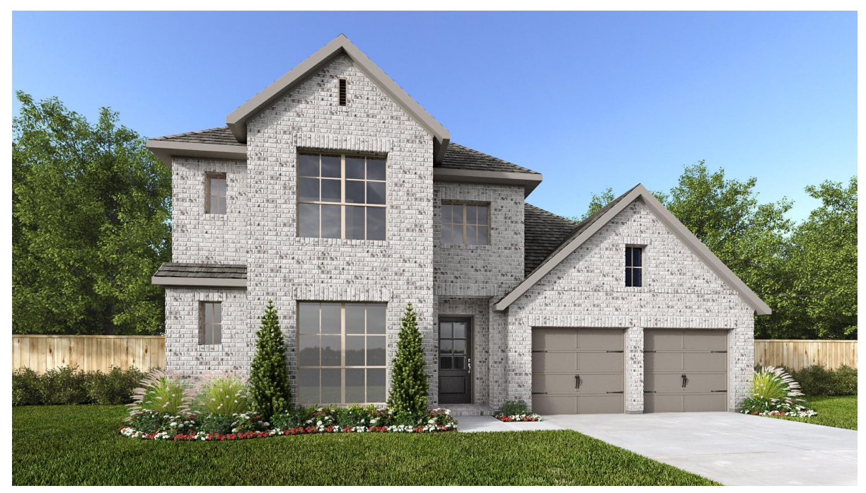
DESIGN 3088W E-1