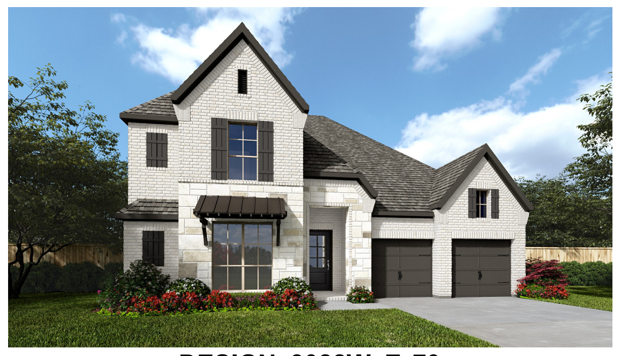
DESIGN 3088W E-70

This design, as originally designed and prior to any changes you make, is estimated to yield approximately the number of square feet shown on page 1. All dimensions are approximate. Square footage may a pased on as-built dimensions, configurations, plan options and/or the method of calculation. Designs are not-to-scale, and are conceptual illustrations that may differ from construction plans or completed improvements. A design may depict features not available on all homesites or in all communities. Perry Homes reserves the right to make changes in plans and specifications, and to substitute material or similar quality. Prices, terms, promotions, plans, dimensions, features, options, amenities, elevations, designs, square footages, specifications, materials, and availability of homes or communities are subject to change without notice or obligation. All obligations will be governed by a written contract. This design does not constitute a commitment to build a particular floor plan or home in any given community. Some floor plans, and/or elevations may not be available on certain homesites or in a particular community and may require additional charges. Please check with Perry Homes to verify current offerings in the communities you are considering. This rendering is the property of Perry Homes. LLC. Any reproduction or exhibition is strictly prophibited. @ Perry Homes LLC. 2024