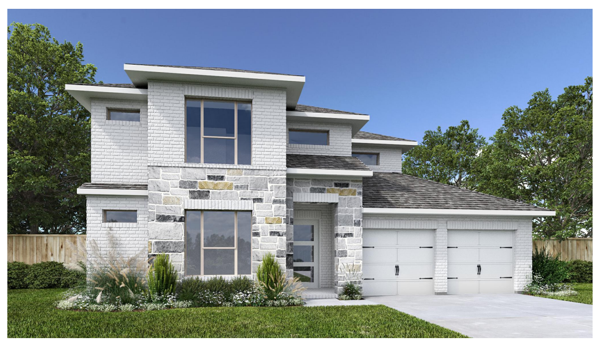
DESIGN 3088W E-50