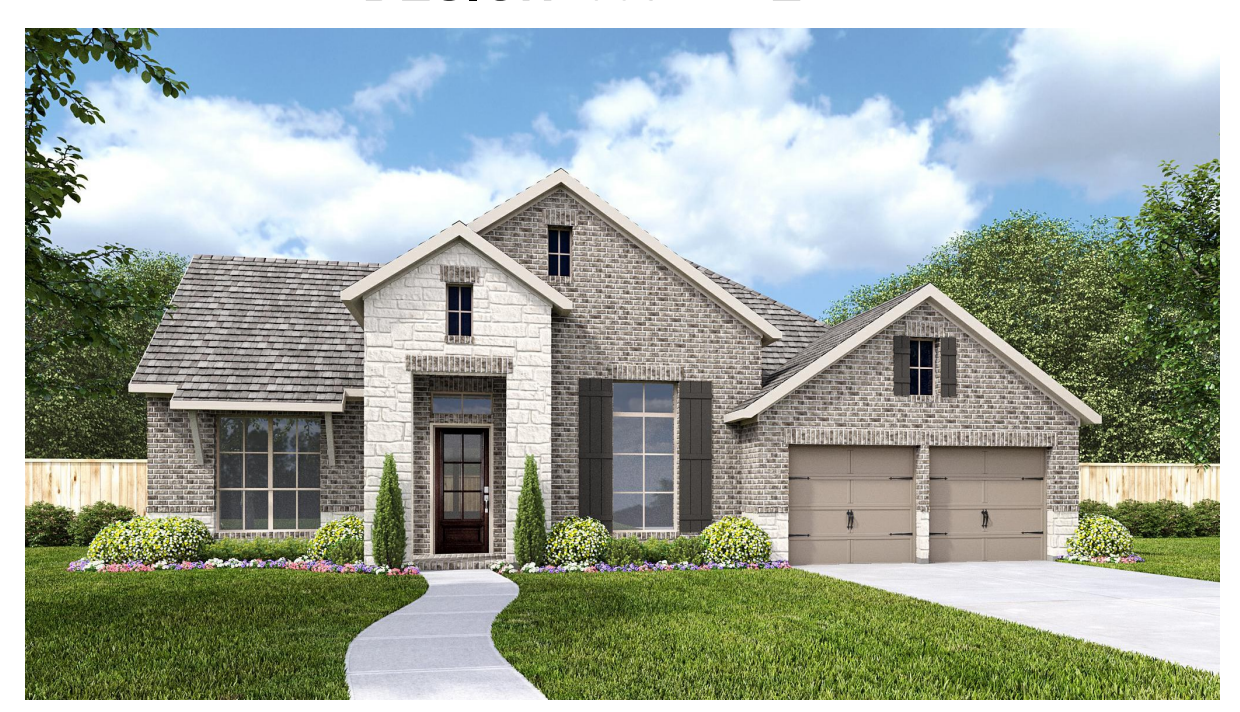
DESIGN 3092W E-50