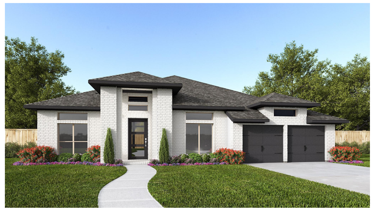
DESIGN 3092W E-1