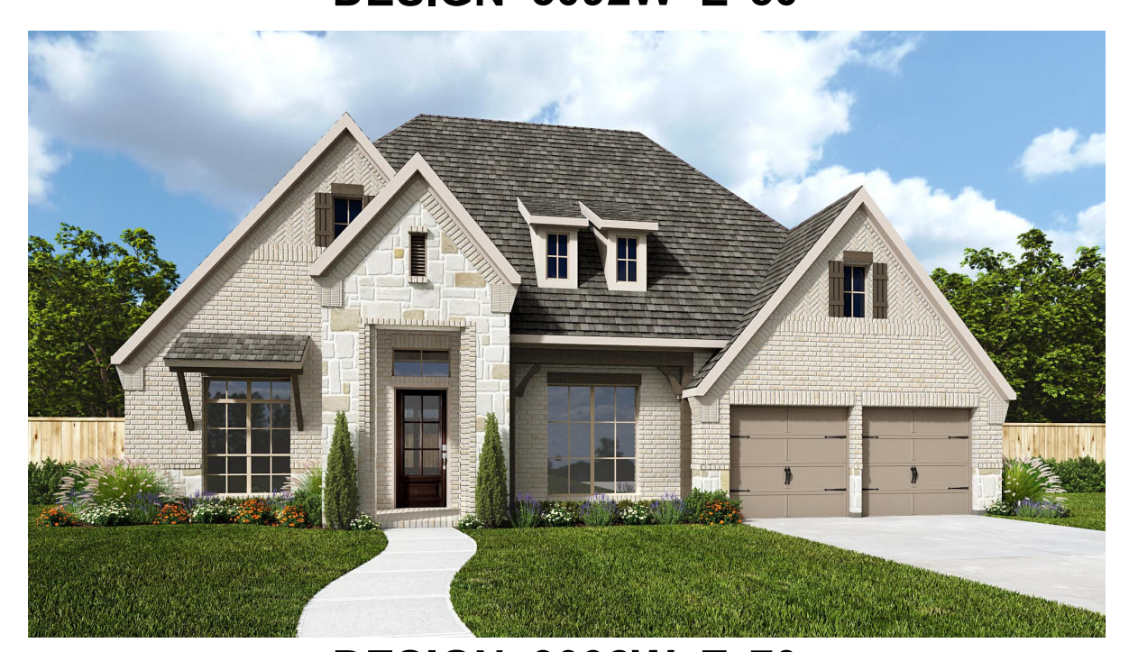
DESIGN 3092W E-70

This design, as originally designed and prior to any changes you make, is estimated to yield approximately the number of square feet shown on page 1. All dimensions are approximate. Square footage may vary based on as-built dimensions, configurations, plan options and/or the method of calculation. Designs are not-to-scale, and are conceptual illustrations that may differ from construction plans or completed improvements. A design may depict features not available on all homesites or in all communities. Perry Homes reserves the right to make changes in plans and specifications, and to substitute material of similar quality. Prices, terms, promotions, plans, dimensions, features, options, amenities, elevations, designs, square footages, specifications, materials, and availability of homes or communities to change without notice or obligation. All obligations will be governed by a written contract. This design does not constitute a commitment to build a particular floor plan or home in any given community. Some floor plans, options, and/or elevations may not be available on certain homesites or in a particular community and may require additional charges. Please check with Perry Homes to verify current offerings in the communities and are considering. This rendering is the property of Perry Homes. LLC. Any reproduction or exhibition is strictly prohibited @ Perry Homes LLC. 2019.