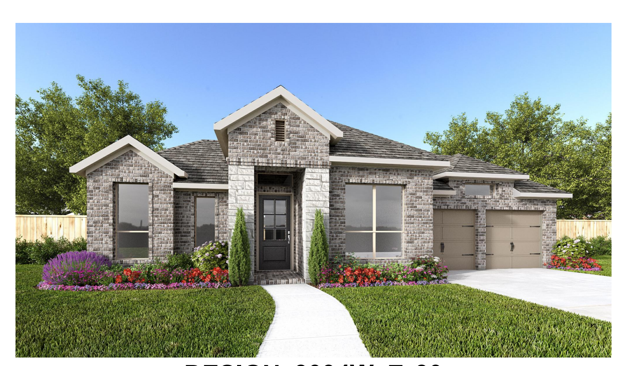
DESIGN 3094W E-30