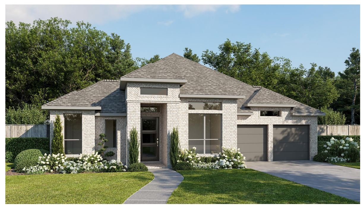
DESIGN 3094W E-1