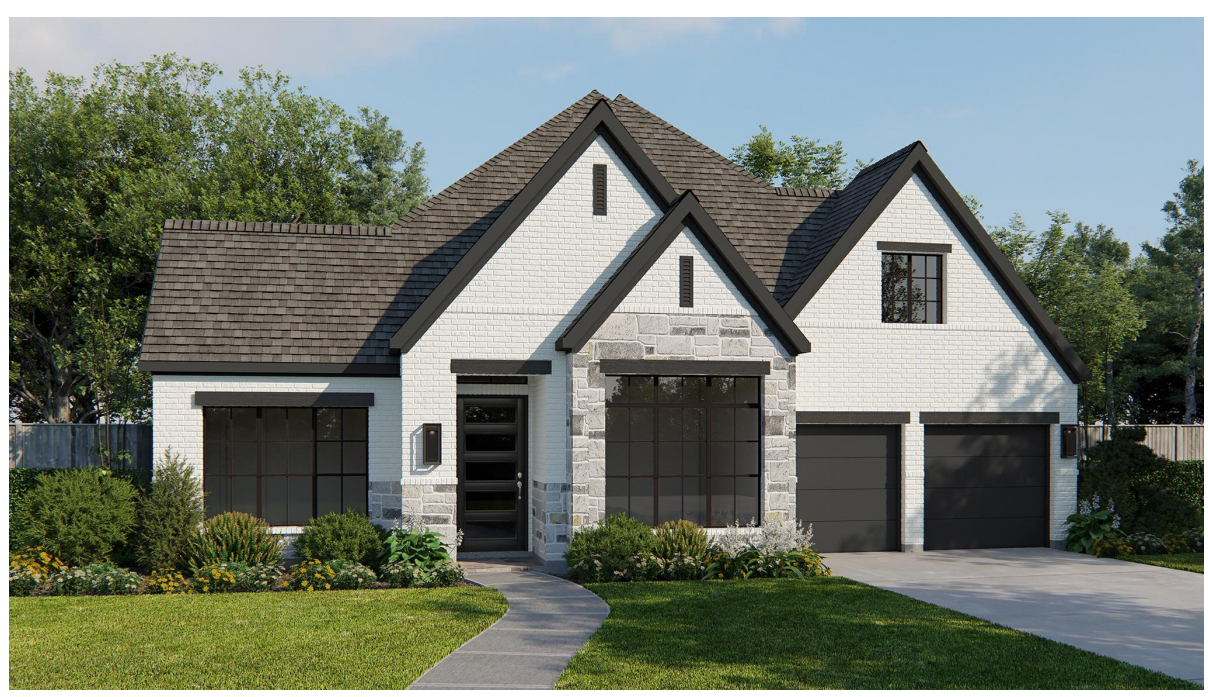
DESIGN 3094W E-70