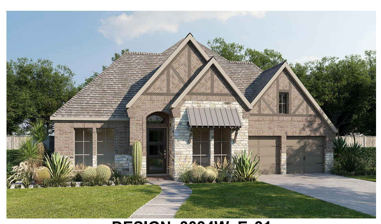
DESIGN 3094W E-91

This design, as originally designed and prior to any changes you make, is estimated to yield approximately the number of square feet shown on page 1. All dimensions are approximate. Square footage may vary based on as-built dimensions, configurations, plan options and/or the method of calculation. Designs are not-to-scale, and are conceptual illustrations that may differ from construction plans or completed improvements. A design may depict features not available on all homesites or in all communities. Perry Homes reserves the right to make changes in plans and specifications, and to substitute material of similar quality. Prices, terms, promotions, plans, dimensions, features, options, amenities, elevations, designs, square footages, specifications, materials, and availability of homes or communities to change without notice or obligation. All obligations will be governed by a written contract. This design does not constitute a commitment to build a particular floor plan or home in any given community. Some floor plans, options, and/or elevations may not be available on certain homesites or in a particular community and may require additional charges. Please check with Perry Homes to verify current offerings in the communities and are considering. This rendering is the property of Perry Homes. LLC. Any reproduction or exhibition is strictly prohibited @ Perry Homes LLC. 2019