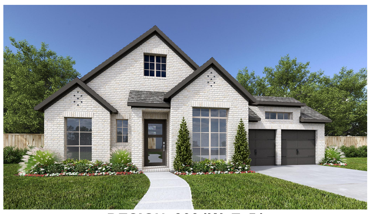
DESIGN 3094W E-51