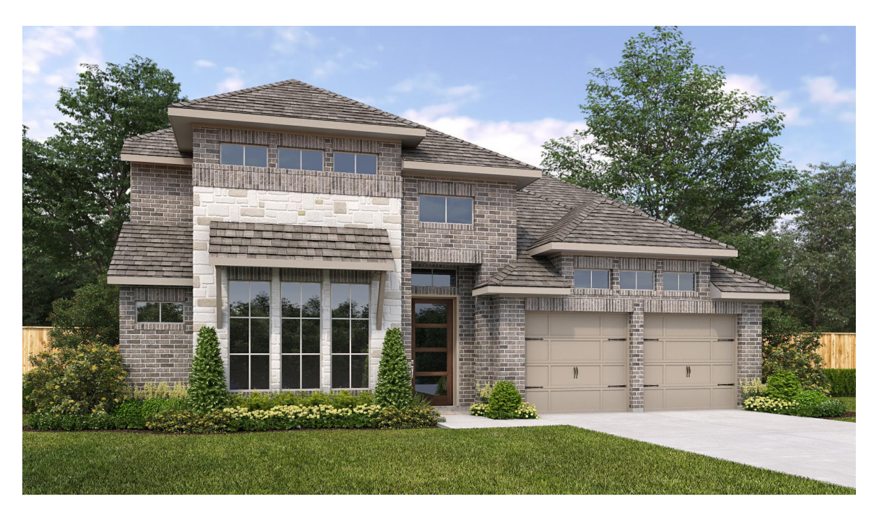
DESIGN 3095W E-51