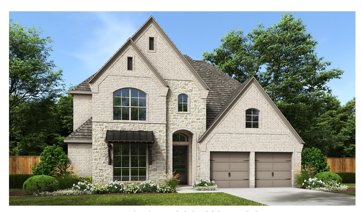
DESIGN 3095W E-91

This design, as originally designed and prior to any changes you make, is estimated to yield approximately the number of square feet shown on page 1. All dimensions are approximate. Square footage ma vary based on as-built dimensions, configurations, plan options and/or the method of calculation. Designs are not-to-scale, and are conceptual illustrations that may differ from construction plans or completed improvements. A design may depict features not available on all homesites or in all communities. Perry Homes reserves the right to make changes in plans and specifications, and to substitute material or similar quality. Prices, terms, promotions, plans, dimensions, features, options, amenities, elevations, designs, square footages, specifications, materials, and availability of homes or communities are subject to change without notice or obligation. All obligations will be governed by a written contract. This design does not constitute a commitment to build a particular floor plan or home in any given community. Some floor plans, options, and/or elevations may not be available on certain homesites or in a particular community and may require additional charges. Please check with Perry Homes to verify current offerings in the communities you are considering. This rendering is the property of Perry Homes, LLC. Any reproduction or exhibition is strictly prohibited. Perry Homes, LLC 2024