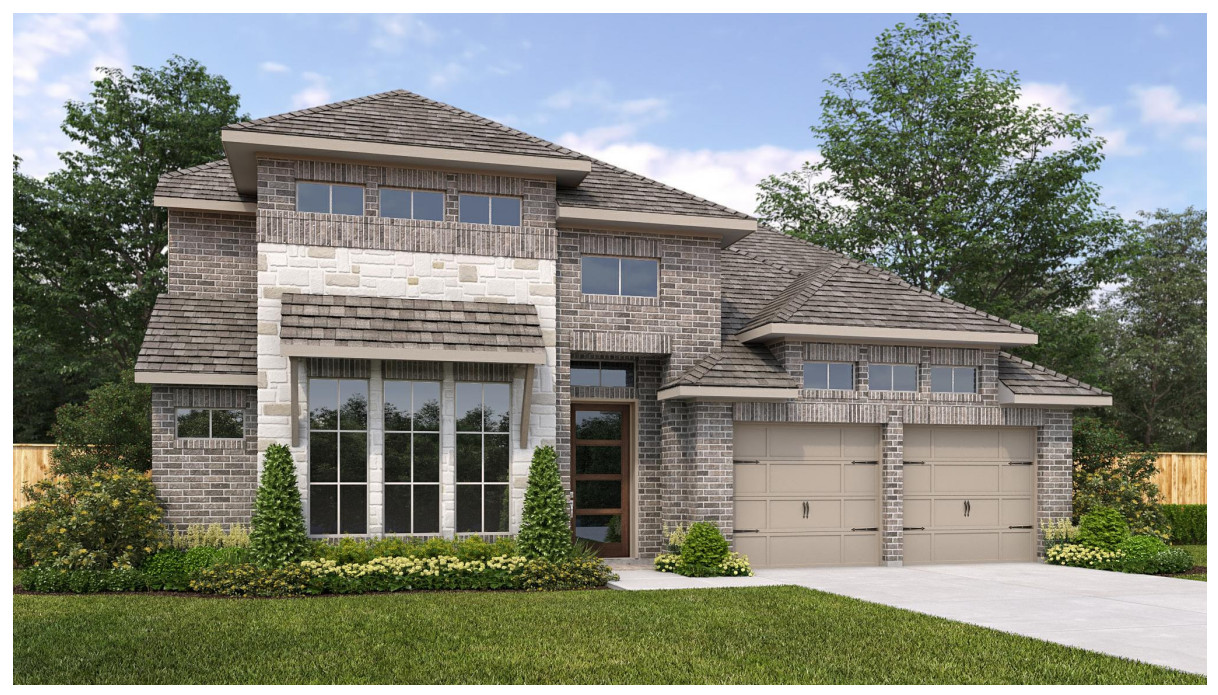
DESIGN 3095W E-51