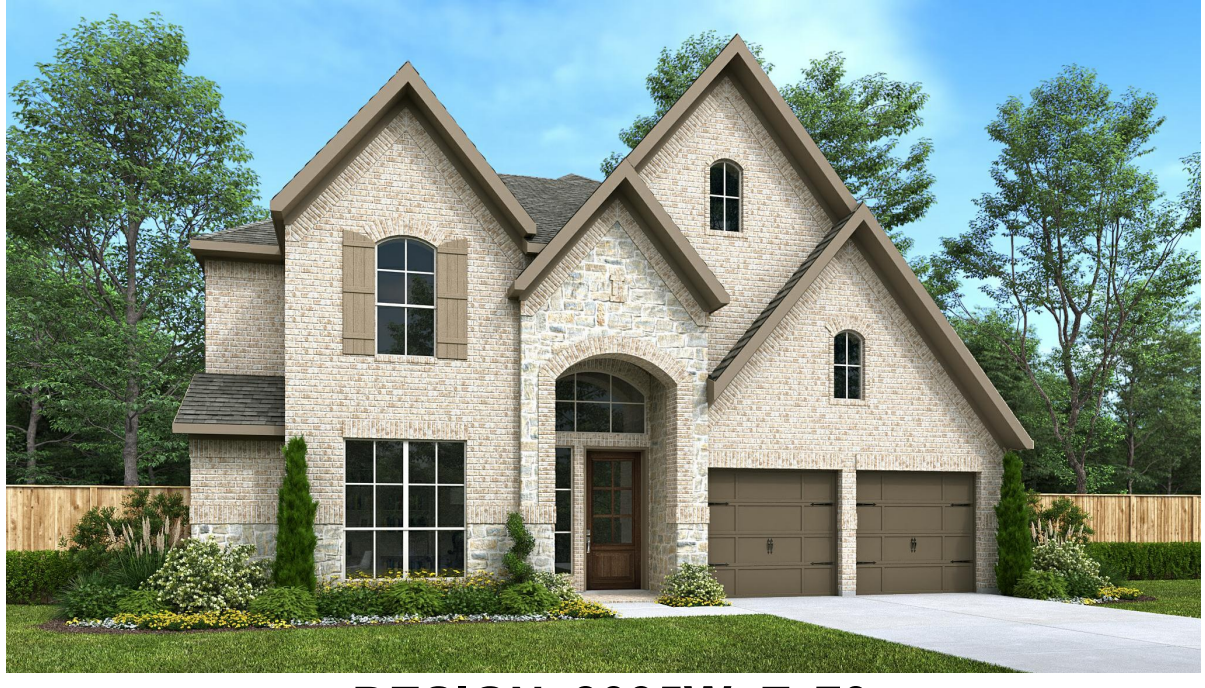
DESIGN 3095W E-70