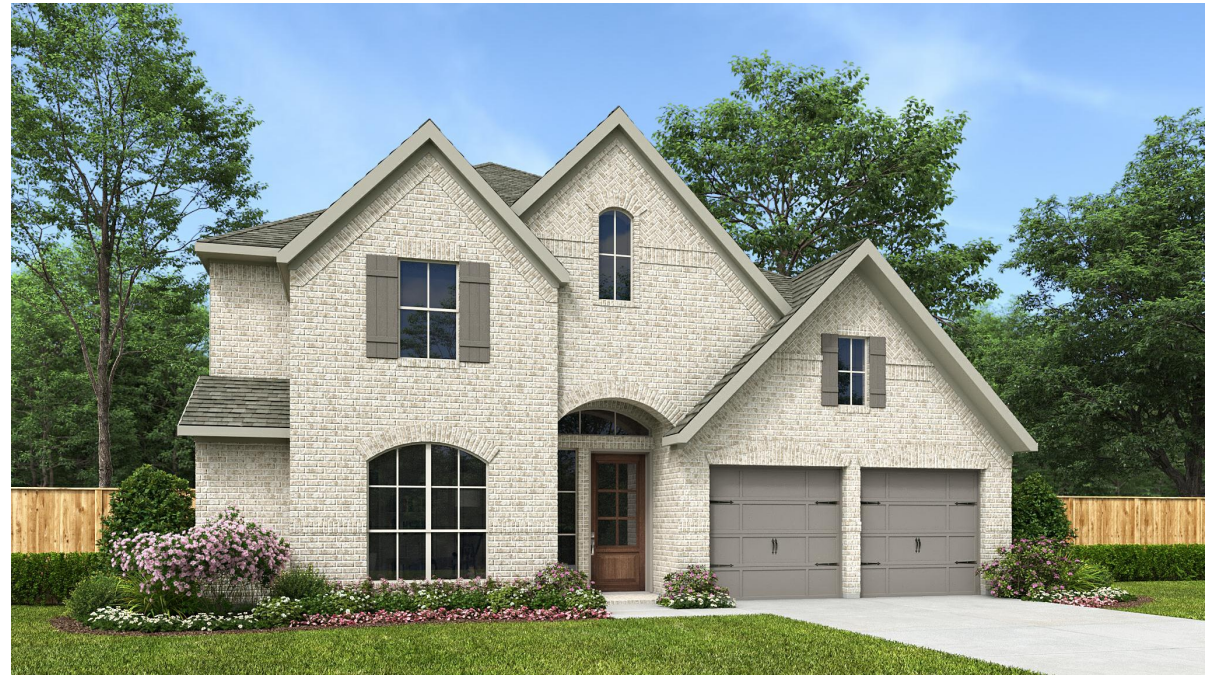
DESIGN 3095W E-1