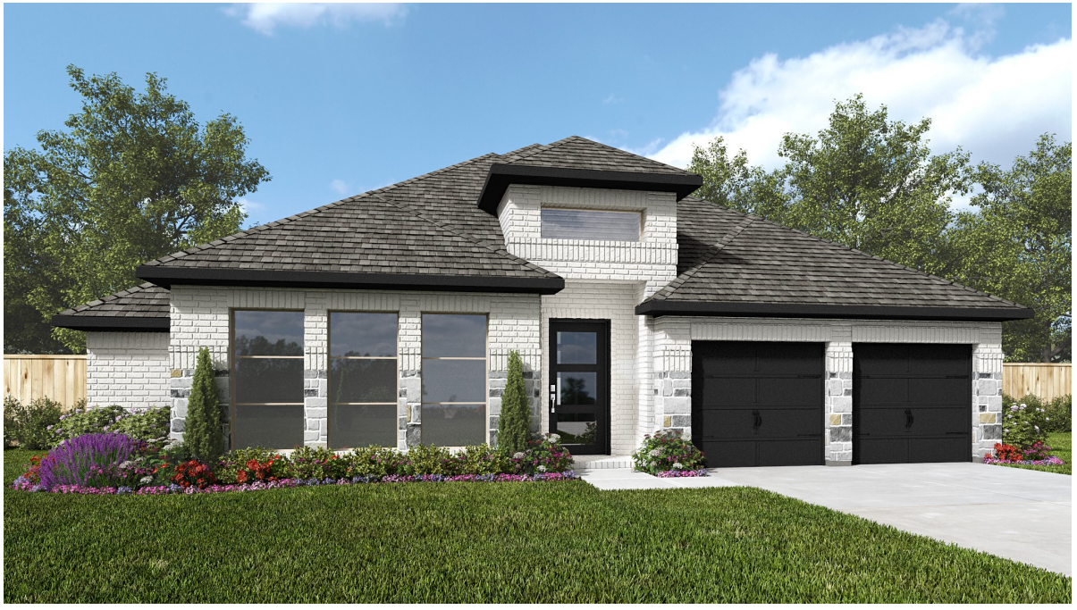
DESIGN 3118W E-32

*See Page 3 for Details and Disclaimers | © Perry Homes, LLC 2024 | 3/28/2024 11:40:37 AM (60' CL) PerryHomes.com