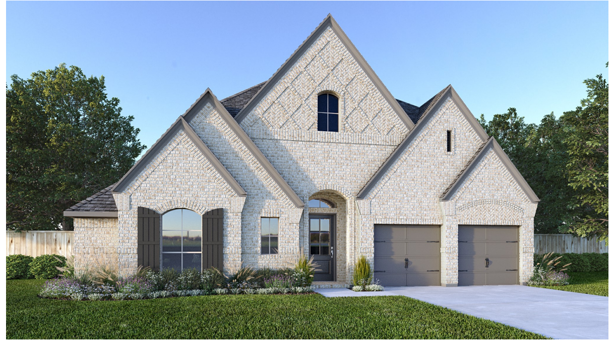
DESIGN 3118W E-1