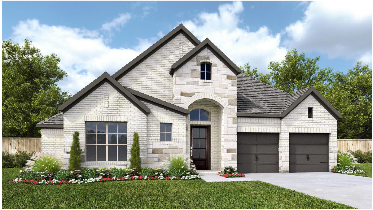
DESIGN 3118W E-31