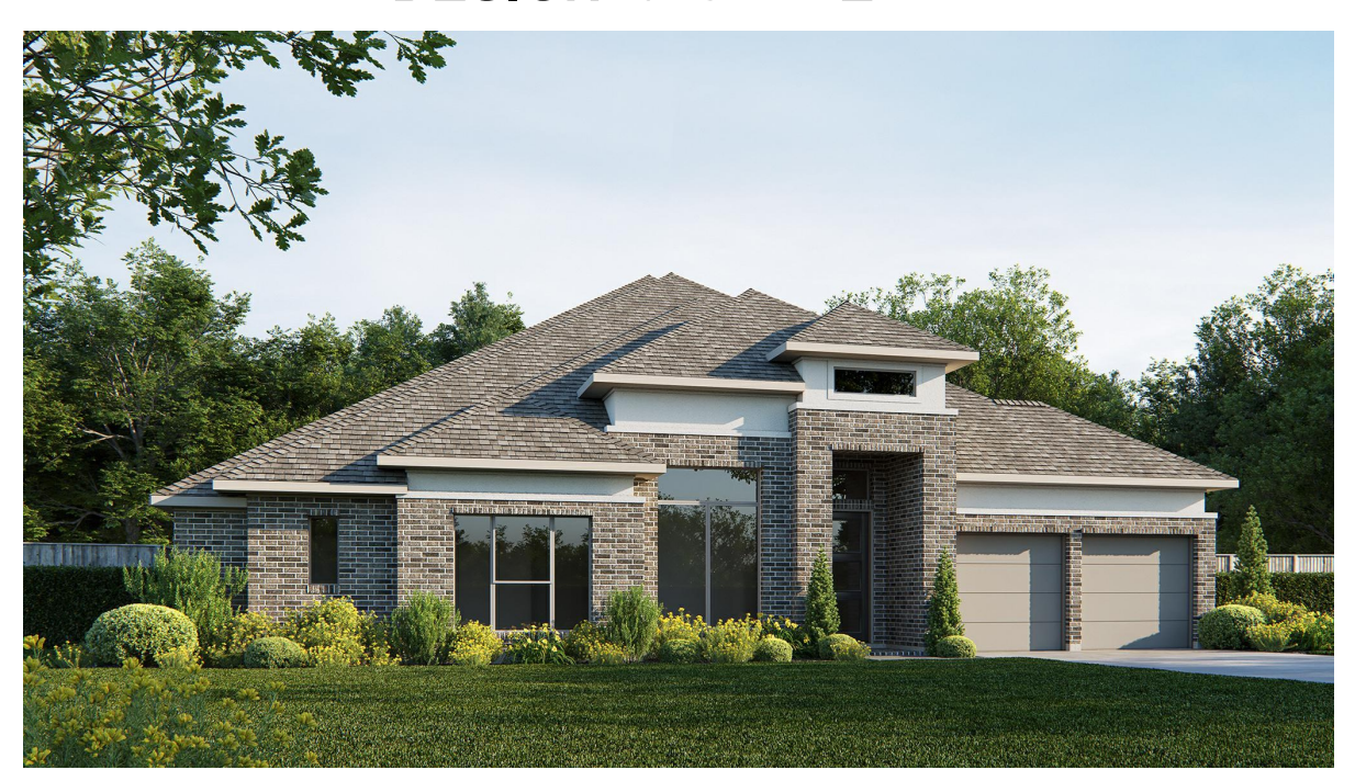
DESIGN 3152W E-30