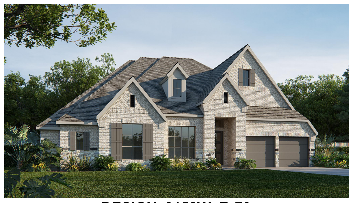
DESIGN 3152W E-70

This design, as originally designed and prior to any changes you make, is estimated to yield approximately the number of square feet shown on page 1. All dimensions are approximate. Square footage may vary based on as-built dimensions, configurations, plan options and/or the method of calculation. Designs are not-to-scale, and are conceptual illustrations that may differ from construction plans or completed improvements. A design may depict features not available on all homesites or in all communities. Perry Homes reserves the right to make changes in plans and specifications, and to substitute material of similar quality. Prices, terms, promotions, plans, dimensions, features, options, amenities, elevations, designs, square footages, specifications, materials, and availability of homes or communities to change without notice or obligation. All obligations will be governed by a written contract. This design does not constitute a commitment to build a particular floor plan or home in any given community. Some floor plans, options, and/or elevations may not be available on certain homesites or in a particular community and may require additional charges. Please check with Perry Homes to verify current offerings in the communities on a green considering. This rendering is the property of Perry Homes. LLC. Any reproduction or exhibition is strictly prohibited @ Perry Homes LLC. 2018