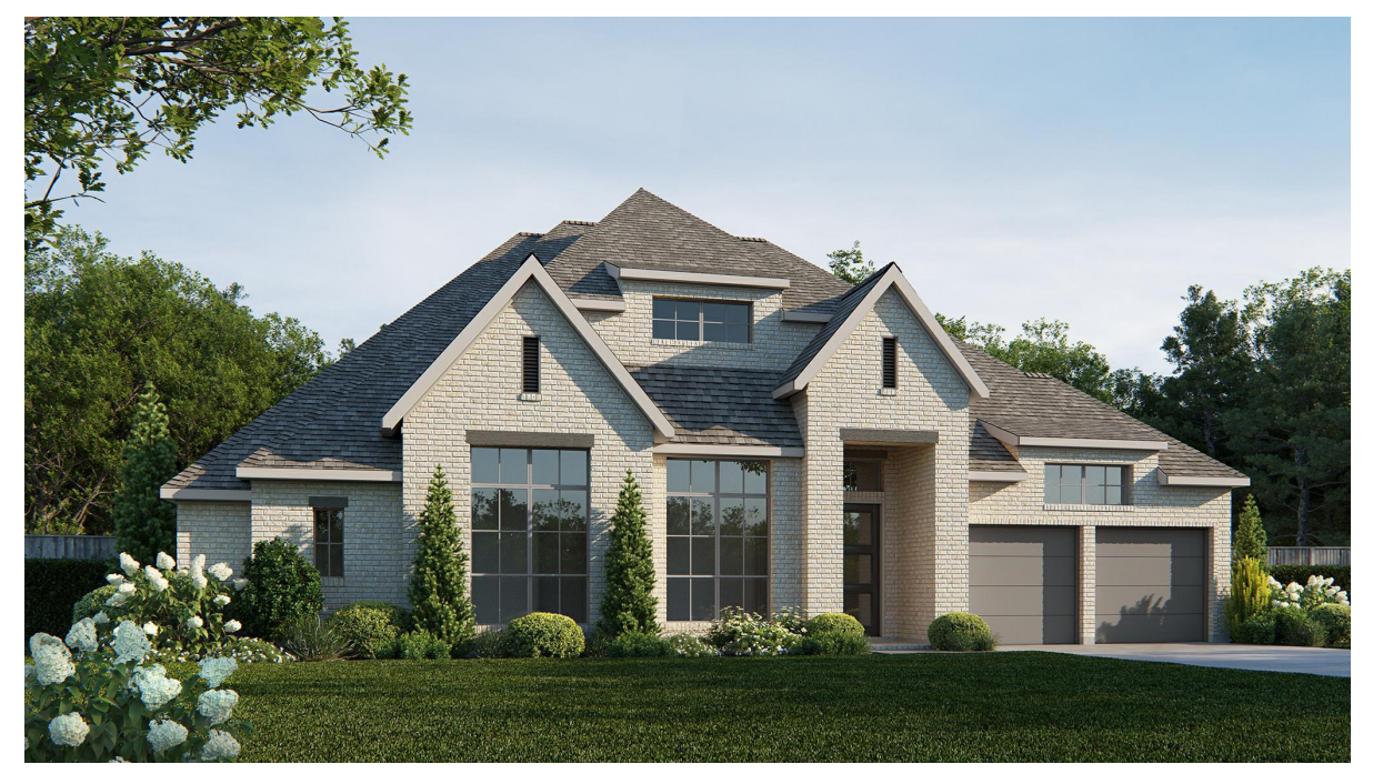
DESIGN 3152W E-1