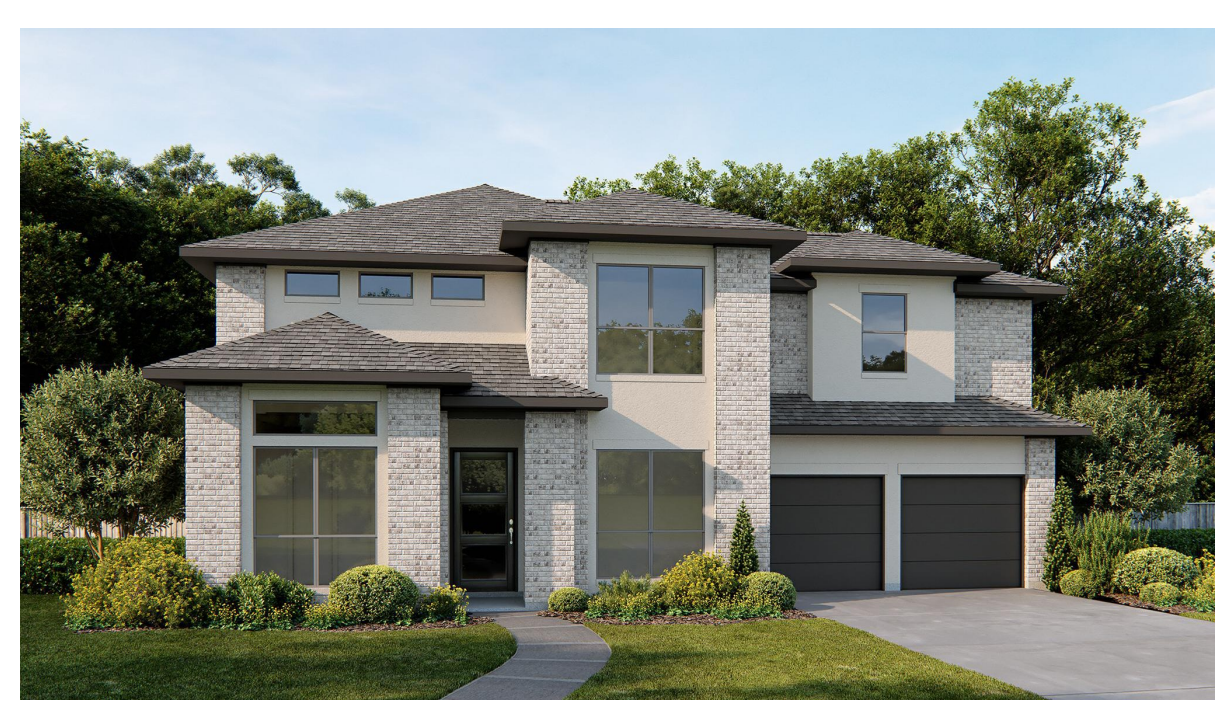
DESIGN 3198W E-1