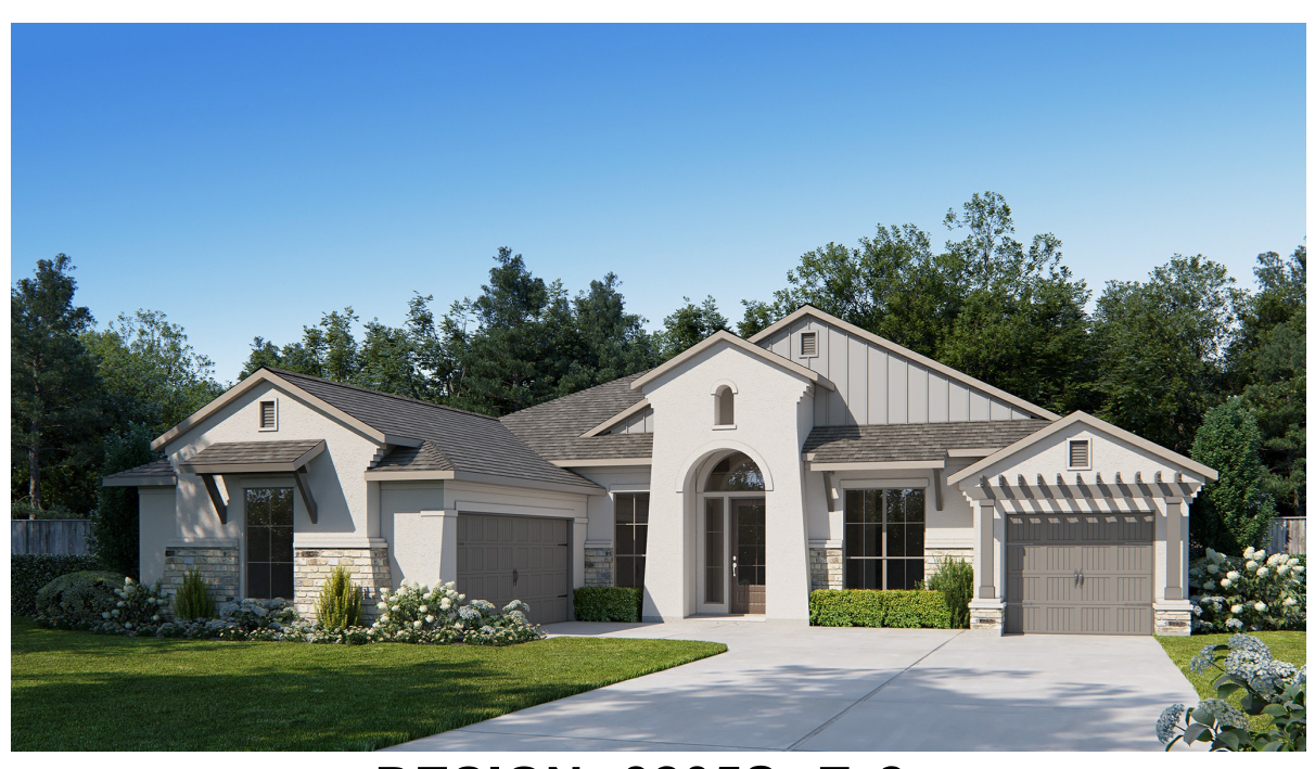
DESIGN 3205S E-2

This design, as originally designed and prior to any changes you make, is estimated to yield approximately the number of square feet shown on page 1. All dimensions are approximate. Square footage may vary based on as-built dimensions, configurations, plan options and/or the method of calculation. Designs are not-to-scale, and are conceptual illustrations that may differ from construction plans or completed improvements. A design may depict features not available on all homesites or in all communities. Perry Homes reserves the right to make changes in plans and specifications, and to substitute material of similar quality. Prices, terms, promotions, plans, dimensions, features, options, amenities, elevations, designs, square footages, specifications, materials, and availability of homes or communities even to change without notice or obligation. All obligations will be governed by a written contract. This design does not constitute a commitment to build a particular floor plan or home in any given community. Some floor plans, options, and/or elevations may not be available on certain homesics or in a particular community and may require additional charges. Please check with Perry Homes to verify current offerings in the communities you are considering. This rendering is the property of Perry Homes. LLC. Any reproduction or exhibition is strictly prohibited. © Perry Homes, LLC 2023