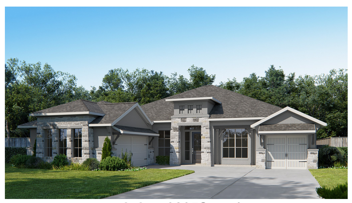
DESIGN 3205S E-1