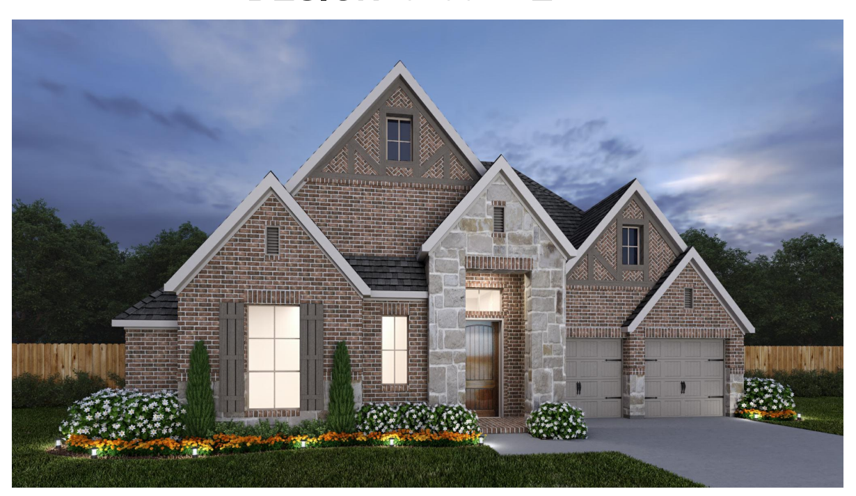
DESIGN 3206W E-70