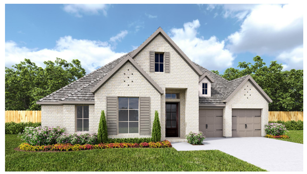
DESIGN 3206W E-1