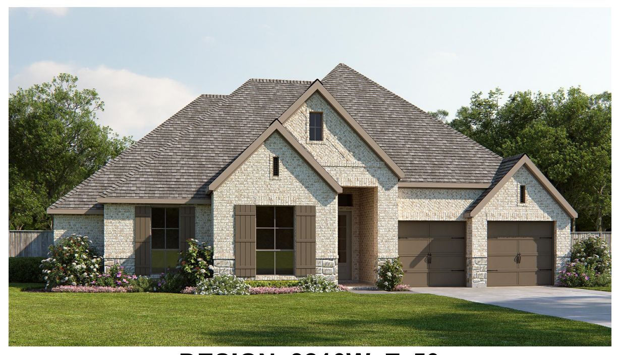
DESIGN 3210W E-50

This design, as originally designed and prior to any changes you make, is estimated to yield approximately the number of square feet shown on page 1. All dimensions are approximate. Square footage may vary based on as-built dimensions, configurations, plan options and/or the method of calculation. Designs are not-to-scale, and are conceptual illustrations that may differ from construction plans or completed improvements. A design may depict features not available on all homesites or in all communities. Perry Homes reserves the right to make changes in plans and specifications, and to substitute material of similar quality. Prices, terms, promotions, plans, dimensions, features, options, amenities, elevations, designs, square footages, specifications, materials, and availability of homes or communities to change without notice or obligation. All obligations will be governed by a written contract. This design does not constitute a commitment to build a particular floor plan or home in any given community. Some floor plans, options, and/or elevations may not be available on certain homesites or in a particular community and may require additional charges. Please check with Perry Homes to verify current offerings in the communities and are considering. This rendering is the property of Perry Homes. LLC. Any reproduction or exhibition is strictly prohibited @ Perry Homes LLC. (Perry Homes LLC.)