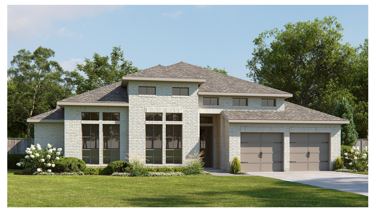
DESIGN 3210W E-1