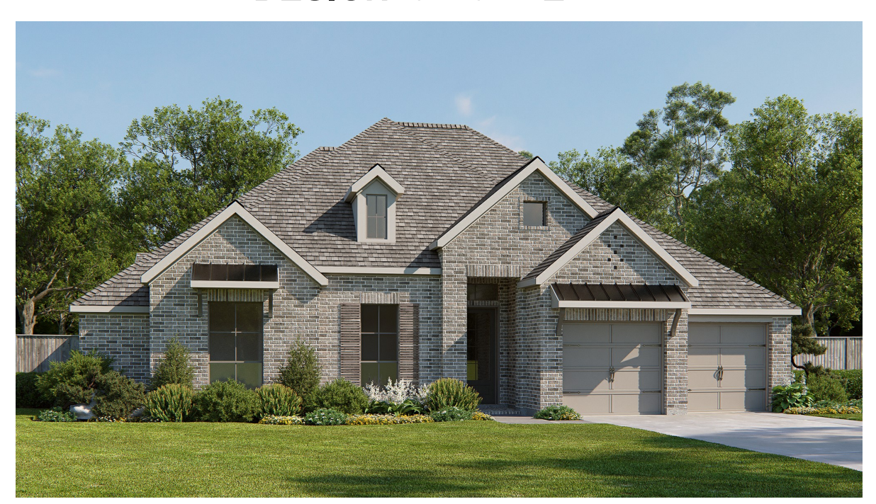
DESIGN 3210W E-30