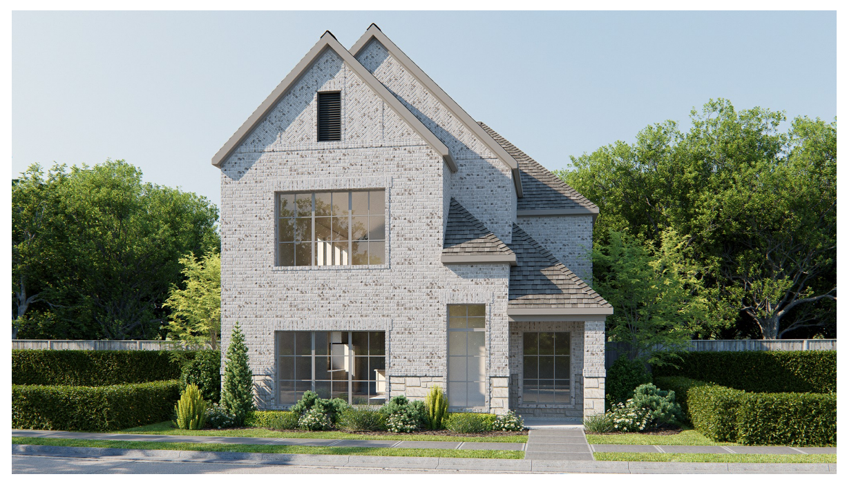
DESIGN 3235T E-1