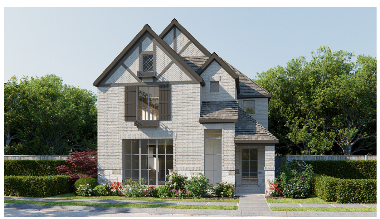
DESIGN 3235T E-50