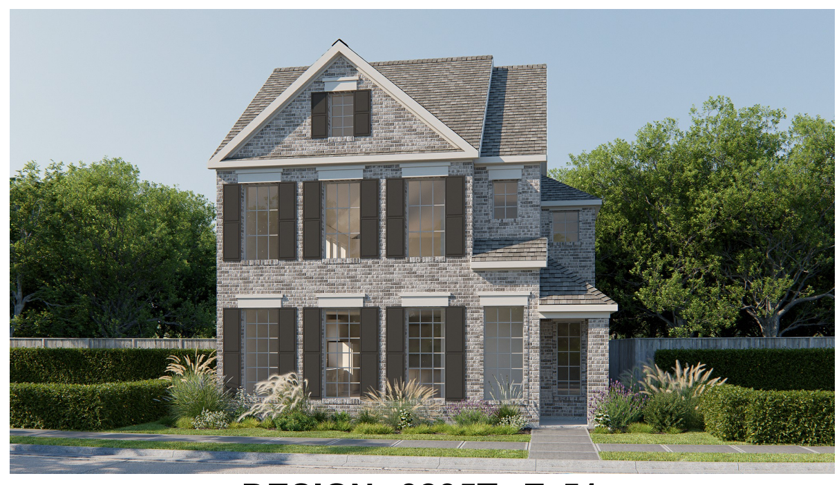
DESIGN 3235T E-51

This design, as originally designed and prior to any changes you make, is estimated to yield approximately the number of square feet shown on page 1. All dimensions are approximate. Square footage may vary based on as-built dimensions, configurations, plan options and/or the method of calculation. Designs are not-to-scale, and are conceptual illustrations that may differ from construction plans or completed improvements. A design may depict features not available on all homesites or in all communities. Perry Homes reserves the right to make changes in plans and specifications, and to substitute material of similar quality. Prices, terms, promotions, plans, dimensions, features, options, amenities, elevations, designs, square footages, specifications, materials, and availability of homes or communities to change without notice or obligation. All obligations will be governed by a written contract. This design does not constitute a commitment to build a particular floor plan or home in any given community. Some floor plans, options, and/or elevations may not be available on certain homesites or in a particular community and may require additional charges. Please check with Perry Homes to verify current offerings in the communities and are considering. This rendering is the property of Perry Homes. LLC. Any reproduction or exhibition is strictly prohibited @ Perry Homes LLC. 2019.