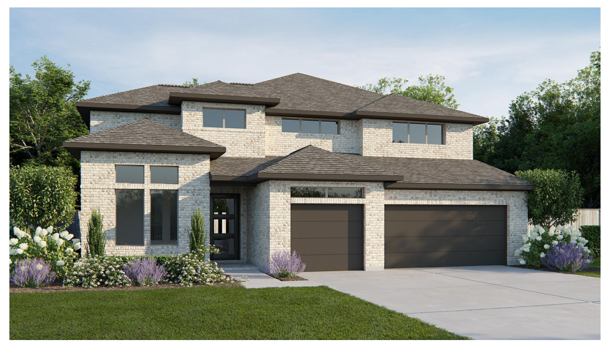
DESIGN 3242V E-1