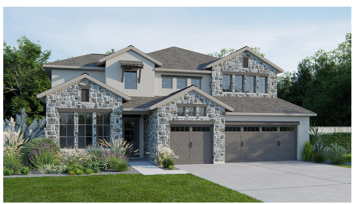
DESIGN 3242V E-71

This design, as originally designed and prior to any changes you make, is estimated to yield approximately the number of square feet shown on page 1. All dimensions are approximate. Square footage may vary based on as-built dimensions, configurations, plan options and/or the method of calculation. Designs are not-to-scale, and are conceptual illustrations that may differ from construction plans or completed improvements. A design may depict features not available on all homesites or in all communities. Perry Homes reserves the right to make changes in plans and specifications, and to substitute material of similar quality. Prices, terms, promotions, plans, dimensions, features, options, amenities, elevations, designs, square footages, specifications, materials, and availability of homes or communities are subject to change without notice or obligation. All obligations will be governed by a written contract. This design does not constitute a commitment to build a particular floor plan or home in any given community Some floor plans, options, and/or elevations may not be available on certain homesites or in a particular community and may require additional charges. Please check with Perry Homes to verify current offerings in the communities you are considering. This rendering is the property of Perry Homes LLC. Any reproduction or exhibition is strictly prohibited. @ Perry Homes LLC. 2013.