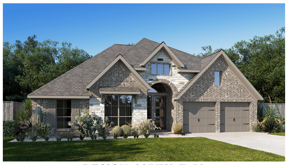
DESIGN 3275W E-50

This design, as originally designed and prior to any changes you make, is estimated to yield approximately the number of square feet shown on page 1. All dimensions are approximate. Square footage may vary based on as-built dimensions, configurations, plan options and/or the method of calculation. Designs are not-to-scale, and are conceptual illustrations that may differ from construction plans or completed improvements. A design may depict features not available on all homesites or in all communities. Perry Homes reserves the right to make changes in plans and specifications, and to substitute material of similar quality. Prices, terms, promotions, plans, dimensions, features, options, amenities, elevations, designs, square footages, specifications, materials, and availability of homes or communities to change without notice or obligation. All obligations will be governed by a written contract. This design does not constitute a commitment to build a particular floor plan or home in any given community. Some floor plans, options, and/or elevations may not be available on certain homesites or in a particular community and may require additional charges. Please check with Perry Homes to verify current offerings in the communities volume considering. This rendering is the property of Perry Homes. LLC. Any reproduction or exhibition is strictly prohibited (@ Perry Homes LLC. 2012).