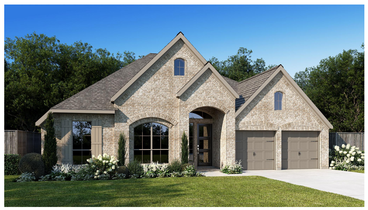
DESIGN 3275W E-1