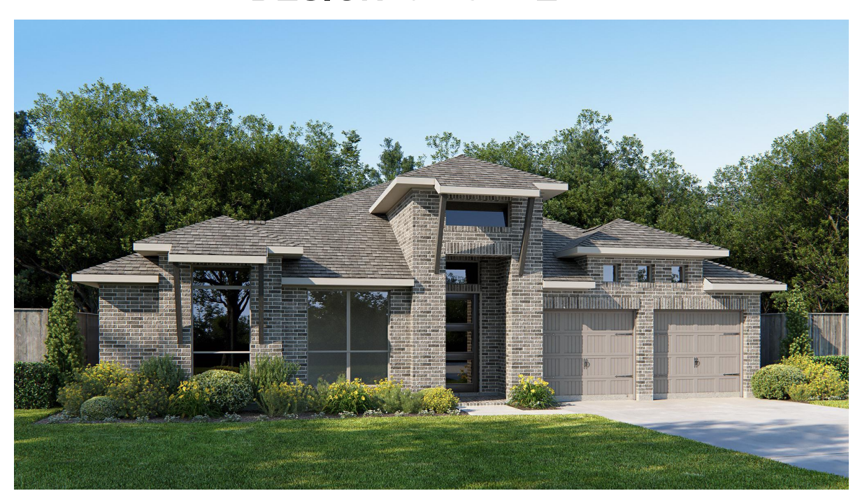
DESIGN 3275W E-2