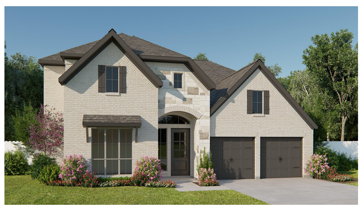
DESIGN 3299W E-30