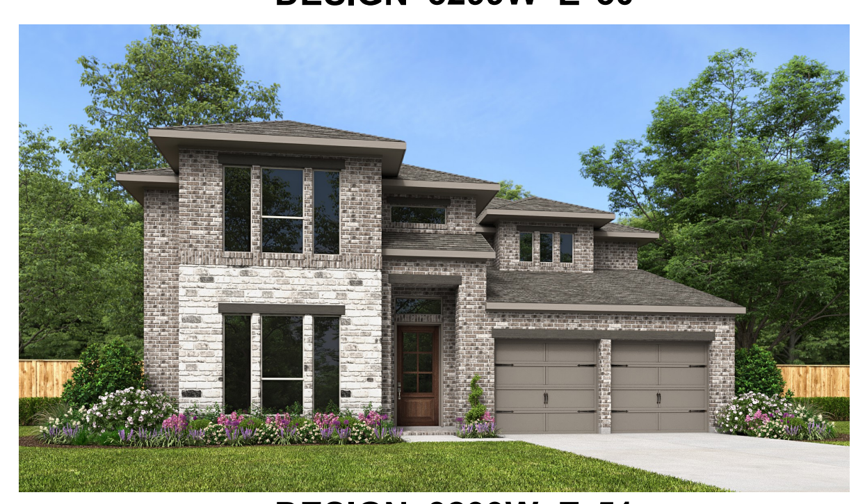
DESIGN 3299W E-51

This design, as originally designed and prior to any changes you make, is estimated to yield approximately the number of square feet shown on page 1. All dimensions are approximate. Square footage may vary based on as-built dimensions, configurations, plan options and/or the method of calculation. Designs are not-to-scale, and are conceptual illustrations that may differ from construction plans or completed improvements. A design may depict features not available on all homesites or in all communities. Perry Homes reserves the right to make changes in plans and specifications, and to substitute material of similar quality. Prices, terms, promotions, plans, dimensions, features, options, amenities, elevations, designs, square footages, specifications, materials, and availability of homes or communities are subject to change without notice or obligation. All obligations will be governed by a written contract. This design does not constitute a commitment to build a particular floor plan or home in any given community Some floor plans, options, and/or elevations may not be available on certain homesites or in a particular community and may require additional charges. Please check with Perry Homes to verify current offerings in the communities you are considering. This rendering is the property of Perry Homes. LLC. Any reproduction or exhibition is strictly prohibited. © Perry Homes. LLC 2019