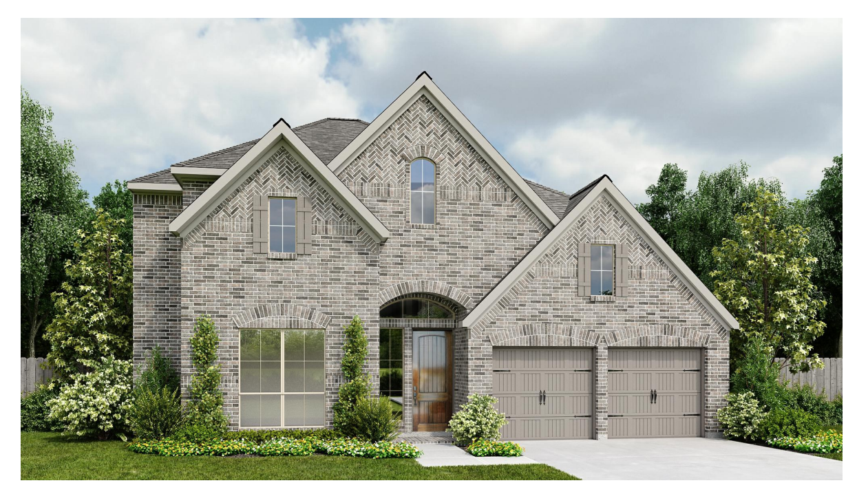
DESIGN 3299W E-1