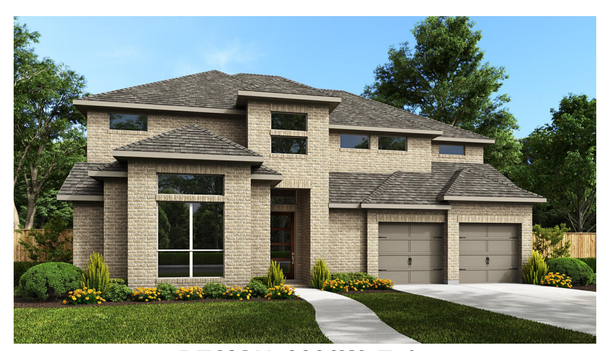
DESIGN 3306W E-1