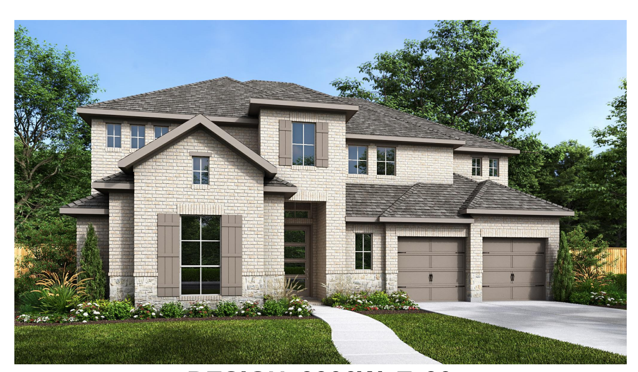
DESIGN 3306W E-30

This design, as originally designed and prior to any changes you make, is estimated to yield approximately the number of square feet shown on page 1. All dimensions are approximate. Square footage may vary based on as-built dimensions, configurations, plan options and/or the method of calculation. Designs are not-to-scale, and are conceptual illustrations that may differ from construction plans or completed improvements. A design may depict features not available on all homesites or in all communities. Perry Homes reserves the right to make changes in plans and specifications, and to substitute material of similar quality. Prices, terms, promotions, plans, dimensions, features, options, amenities, elevations, designs, square footages, specifications, materials, and availability of homes or communities are subject to change without notice or obligation. All obligations will be governed by a written contract. This design does not constitute a commitment to build a particular floor plan or home in any given community Some floor plans, options, and/or elevations may not be available on certain homesites or in a particular community and may require additional charges. Please check with Perry Homes to verify current offerings in the communities you are considering. This rendering is the property of Perry Homes LLC. Any reproduction or exhibition is strictly corphibited. @ Perry Homes LLC. Perry Homes LLC.