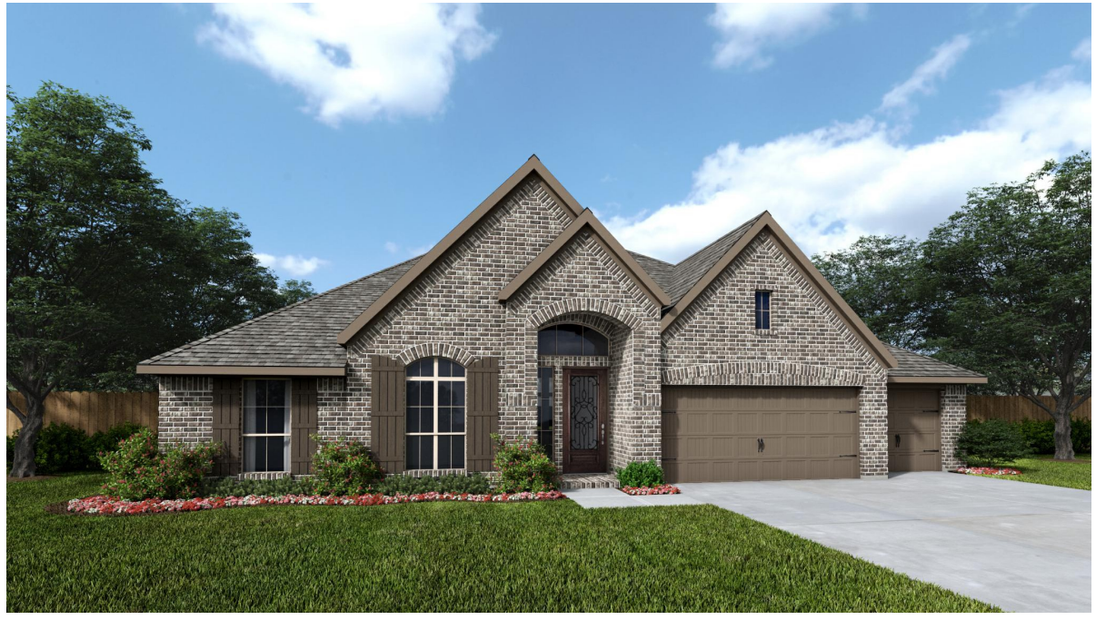
DESIGN 3307W E-1