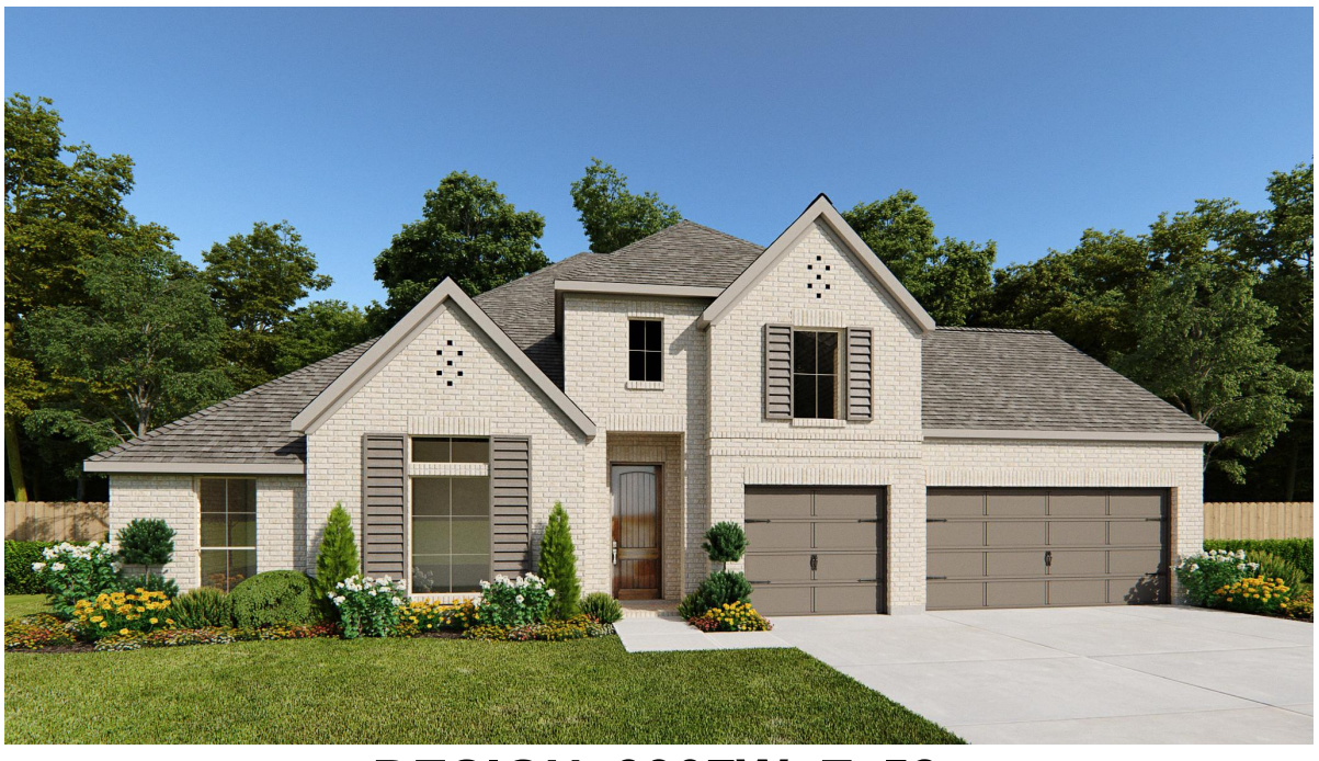
DESIGN 3307W E-52

*See Page 3 for Details and Disclaimers | © Perry Homes, LLC 2022 | 9/14/2023 3:34:58 PM (70' CL) PerryHomes.com