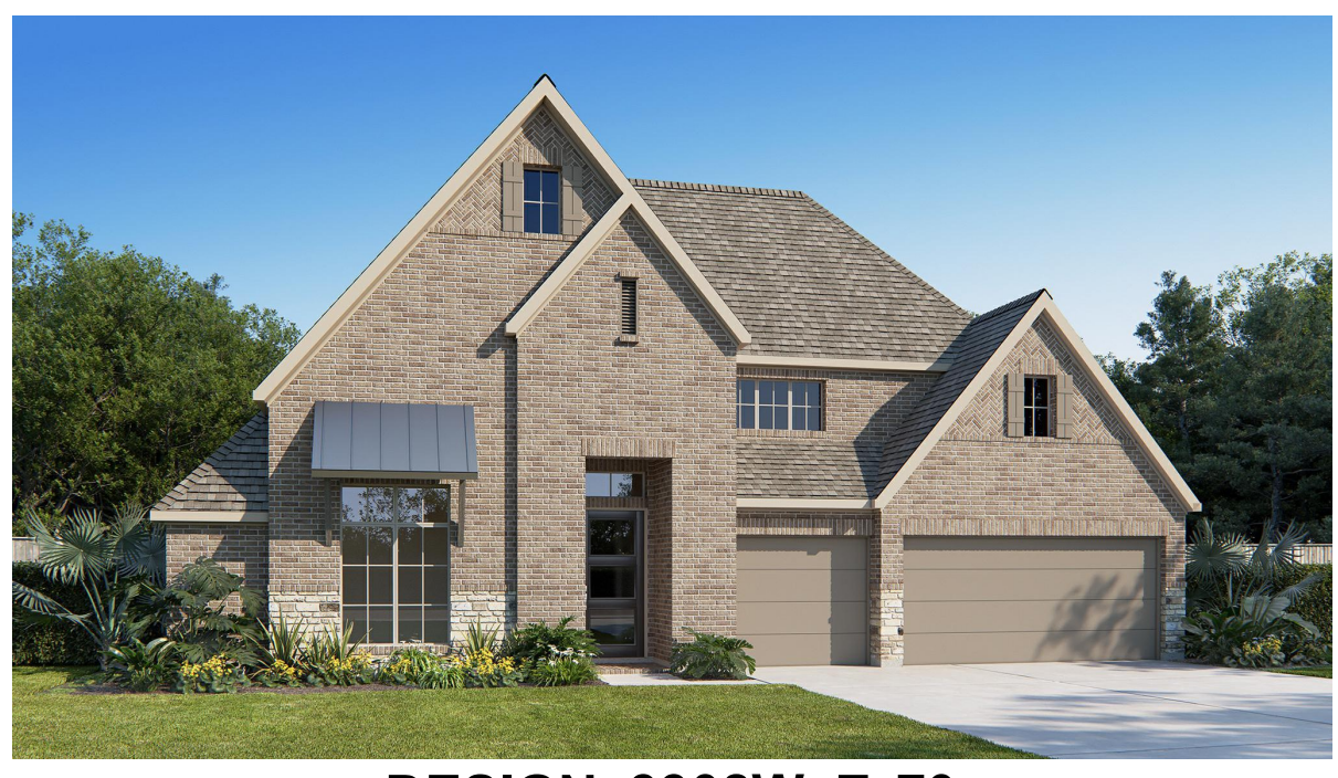
DESIGN 3308W E-70

This design, as originally designed and prior to any changes you make, is estimated to yield approximately the number of square feet shown on page 1. All dimensions are approximate. Square footage may vary based on as-built dimensions, configurations, plan options and/or the method of calculation. Designs are not-to-scale, and are conceptual illustrations that may differ from construction plans or completed improvements. A design may depict features not available on all homesites or in all communities. Perry Homes reserves the right to make changes in plans and specifications, and to substitute material of similar quality. Prices, terms, promotions, plans, dimensions, features, options, amenities, elevations, designs, square footages, specifications, materials, and availability of homes or communities are subject to change without notice or obligation. All obligations will be governed by a written contract. This design does not constitute a commitment to build a particular floor plan or home in any given community Some floor plans, options, and/or elevations may not be available on certain homesites or in a particular community and may require additional charges. Please check with Perry Homes to verify current offerings in the communities are considering. This rendering is the property of Perry Homes. LLC. Any reproduction or exhibition is strictly prohibited @ Perry Homes LLC. 2022