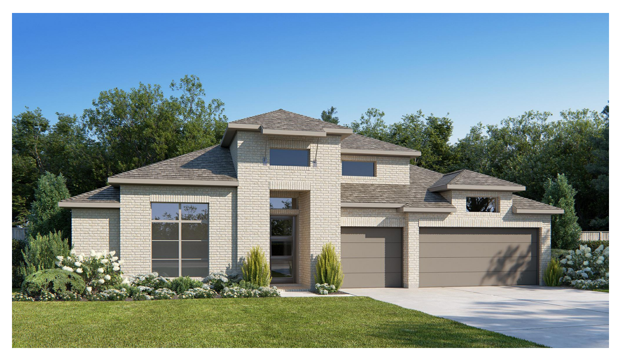
DESIGN 3308W E-1