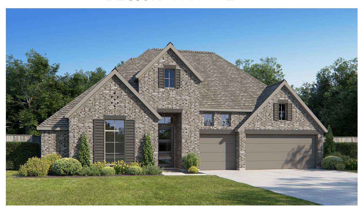
DESIGN 3308W E-30