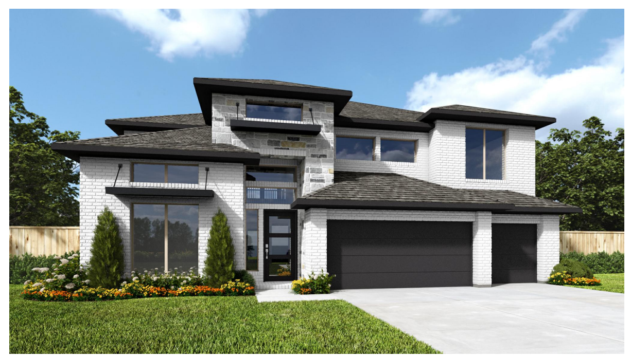
DESIGN 3393W E-32