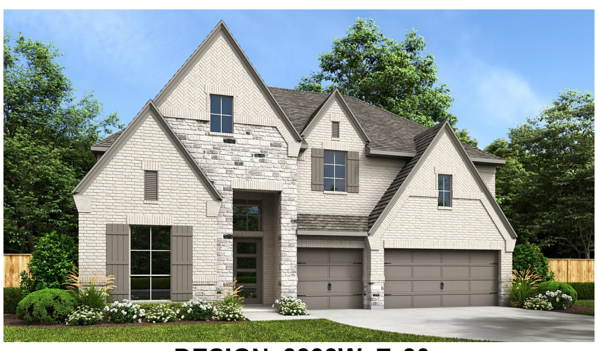
DESIGN 3393W E-30