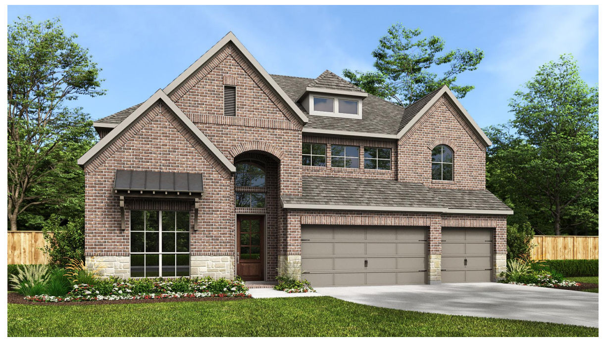
DESIGN 3393W E-1