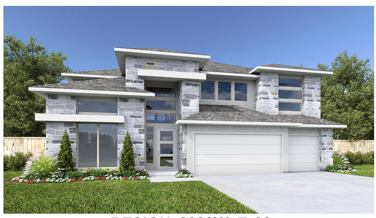
DESIGN 3393W E-33

This design, as originally designed and prior to any changes you make, is estimated to yield approximately the number of square feet shown on page 1. All dimensions are approximate. Square footage may vary based on as-built dimensions, configurations, plan options and/or the method of calculation. Designs are not-to-scale, and are conceptual illustrations that may differ from construction plans or completed improvements. A design may depict features not available on all homesites or in all communities. Perry Homes reserves the right to make changes in plans and specifications, and to substitute material of similar quality. Prices, terms, promotions, plans, dimensions, features, options, amenities, elevations, designs, square footages, specifications, materials, and availability of homes or communities are subject to change without notice or obligation. All obligations will be governed by a written contract. This design does not constitute a commitment to build a particular floor plan or home in any given community Some floor plans, options, and/or elevations may not be available on certain homesites or in a particular community and may require additional charges. Please check with Perry Homes to verify current offerings in the communities are considering. This rendering is the property of Perry Homes II C. Any reproduction or exhibition is strictly prohibited @ Perry Homes II C. 2024