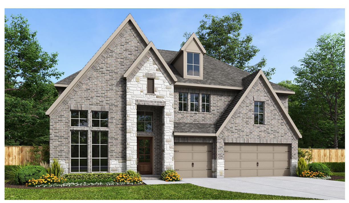
DESIGN 3393W E-2