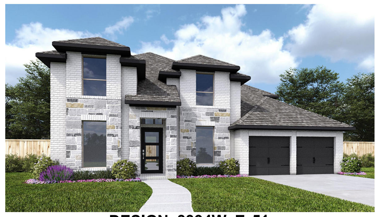
DESIGN 3394W E-51

This design, as originally designed and prior to any changes you make, is estimated to yield approximately the number of square feet shown on page 1. All dimensions are approximate. Square footage may a pased on as-built dimensions, configurations, plan options and/or the method of calculation. Designs are not-to-scale, and are conceptual illustrations that may differ from construction plans or completed improvements. A design may depict features not available on all homesites or in all communities. Perry Homes reserves the right to make changes in plans and specifications, and to substitute material or similar quality. Prices, terms, promotions, plans, dimensions, features, options, amenities, elevations, designs, square footages, specifications, materials, and availability of homes or communities are subject to change without notice or obligation. All obligations will be governed by a written contract. This design does not constitute a commitment to build a particular floor plan or home in any given community. Some floor plans, and/or elevations may not be available on certain homesites or in a particular community and may require additional charges. Please check with Perry Homes to verify current offerings in the communities you are considering. This rendering is the property of Perry Homes I.I.C. Any reproduction or exhibition is strictly prohibited. @ Perry Homes I.I.C. 2024