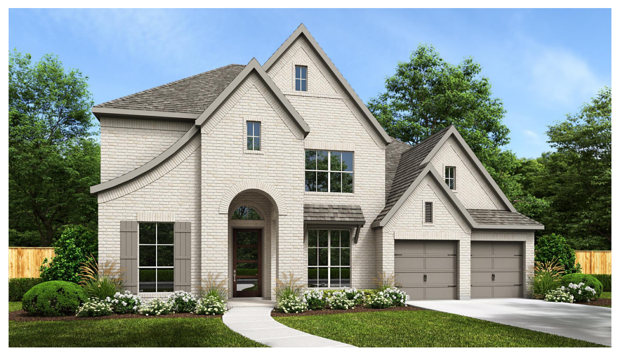
DESIGN 3394W E-1