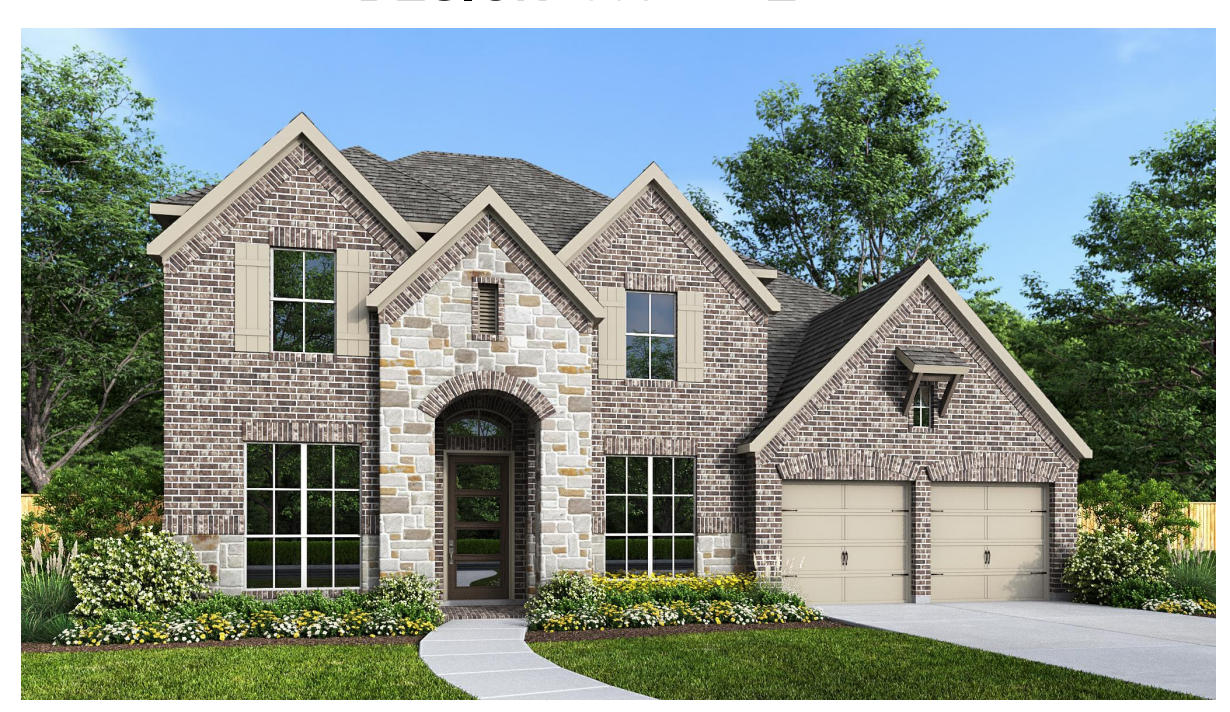
DESIGN 3394W E-30