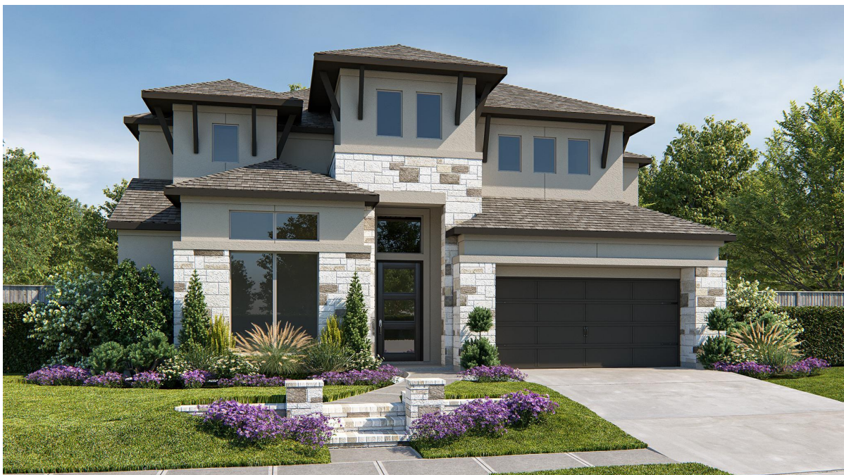
DESIGN 3395M E-30