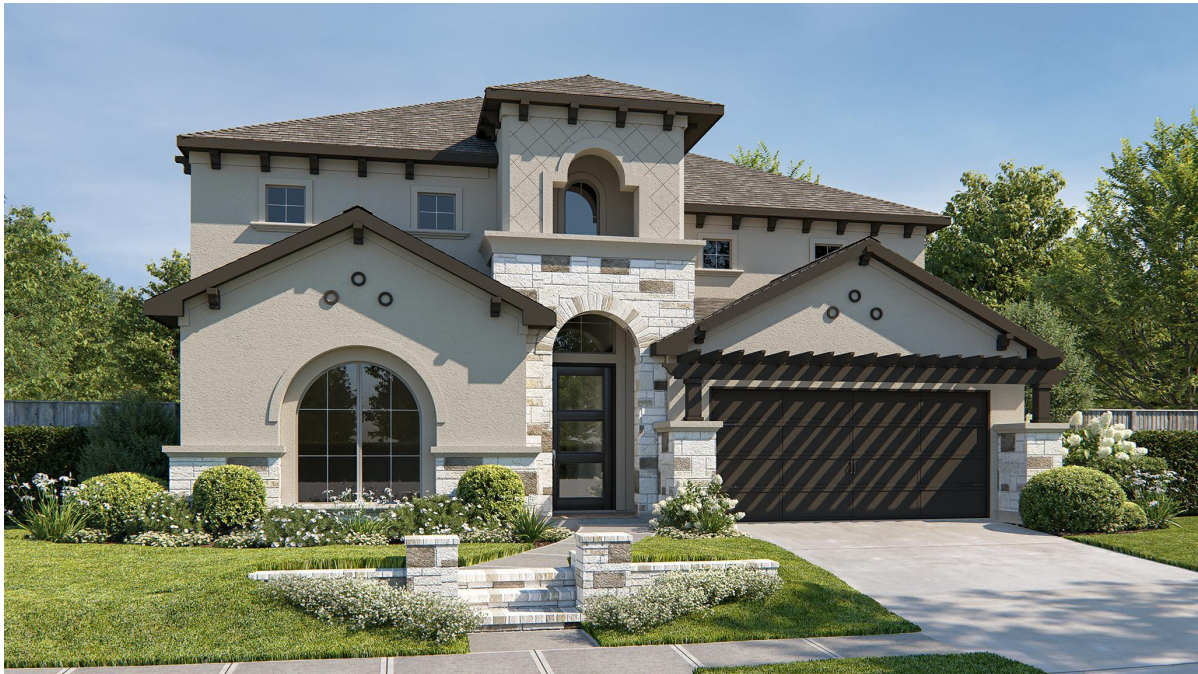
DESIGN 3395M E-1