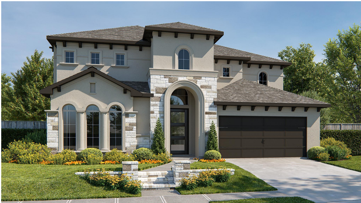
DESIGN 3395M E-2