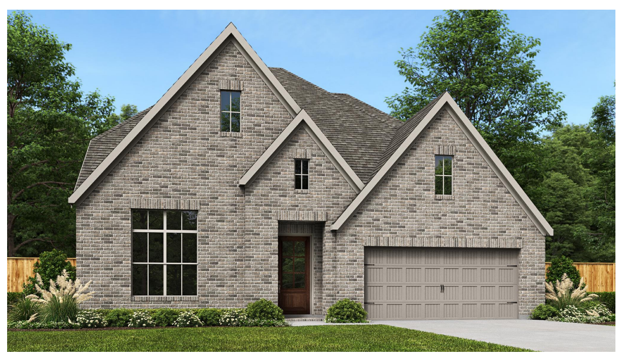
DESIGN 3395P E-2

This design, as originally designed and prior to any changes you make, is estimated to yield approximately the number of square feet shown on page 1. All dimensions are approximate. Square footage may vary based on as-built dimensions, configurations, plan options and/or the method of calculation. Designs are not-to-scale, and are conceptual illustrations that may differ from construction plans or completed improvements. A design may depict features not available on all homesites or in all communities. Perry Homes reserves the right to make changes in plans and specifications, and to substitute material of similar quality. Prices, terms, promotions, plans, dimensions, features, options, amenities, elevations, designs, square footages, specifications, materials, and availability of homes or communities are subject to change without notice or obligation. All obligations will be governed by a written contract. This design does not constitute a commitment to build a particular floor plan or home in any given community Some floor plans, options, and/or elevations may not be available on certain homesites or in a particular community and may require additional charges. Please check with Perry Homes to verify current offerings in the communities are considering. This rendering is the property of Perry Homes 11 C. Any reproduction or exhibition is strictly prohibited @ Perry Homes 11 C. 2023