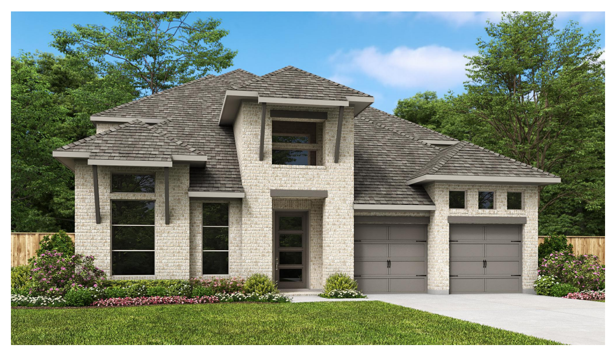
DESIGN 3395P E-1