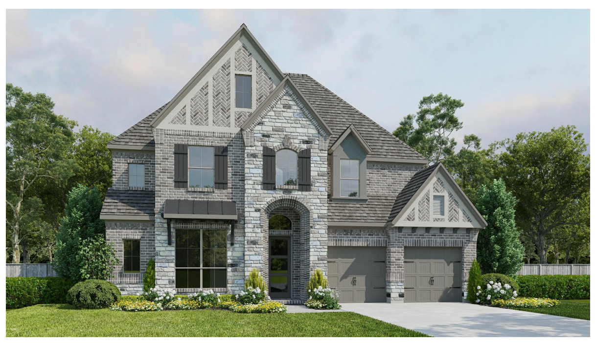
DESIGN 3395W E-100