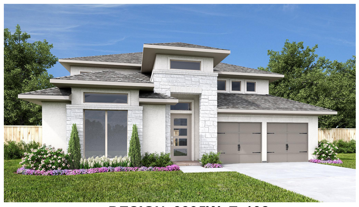
DESIGN 3395W E-102

This design, as originally designed and prior to any changes you make, is estimated to yield approximately the number of square feet shown on page 1. All dimensions are approximate. Square footage may vary based on as-built dimensions, configurations, plan options and/or the method of calculation. Designs are not-to-scale, and are conceptual illustrations that may differ from construction plans or completed improvements. A design may depict features not available on all homesites or in all communities. Perry Homes reserves the right to make changes in plans and specifications, and to substitute material of similar quality. Prices, terms, promotions, plans, dimensions, features, options, amenities, elevations, designs, square footages, specifications, materials, and availability of homes or communities are subject to change without notice or obligation. All obligations will be governed by a written contract. This design does not constitute a commitment to build a particular floor plan or home in any given community Some floor plans, options, and/or elevations may not be available on certain homesites or in a particular community and may require additional charges. Please check with Perry Homes to verify current offerings in the communities are considering. This rendering is the property of Perry Homes II C. Any reproduction or exhibition is strictly prohibited @ Perry Homes II C. 2024