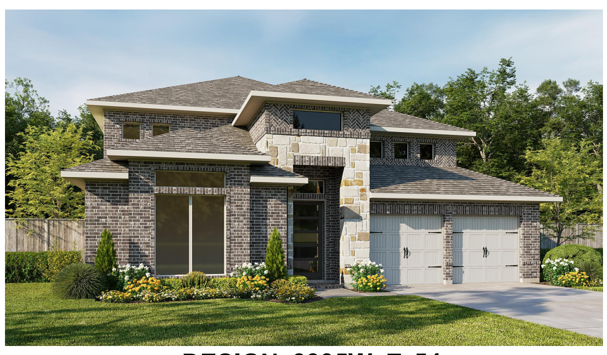
DESIGN 3395W E-54