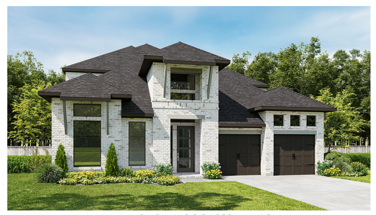
DESIGN 3395W E-72