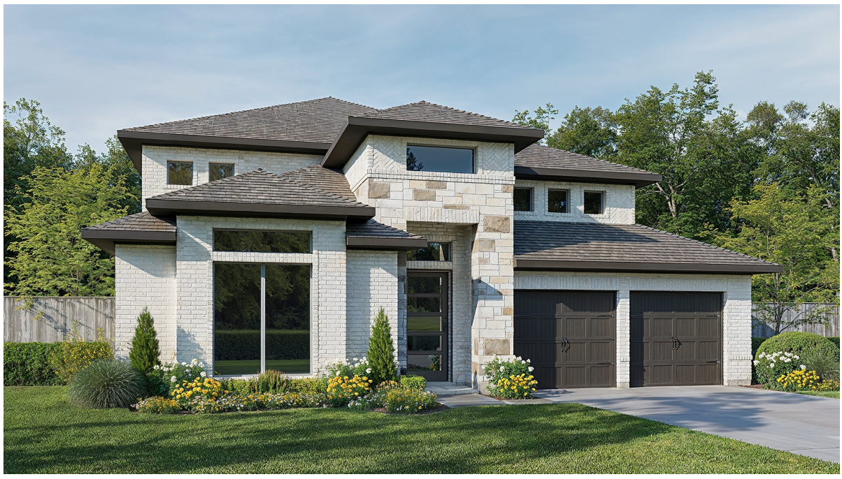
DESIGN 3395W E-54

*See Page 3 for Details and Disclaimers | © Perry Homes, LLC 2024 | 5/29/2024 12:06:18 PM (55' CL) PerryHomes.com