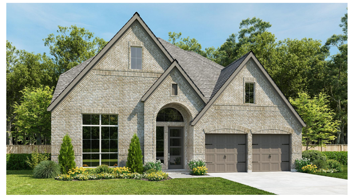
DESIGN 3395W E-1