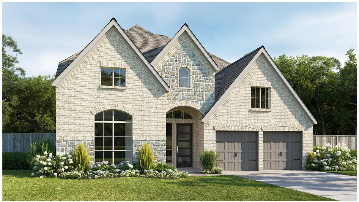
DESIGN 3395W E-50