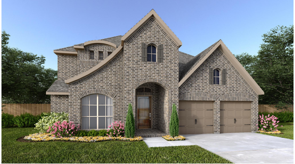
DESIGN 3396W E-1