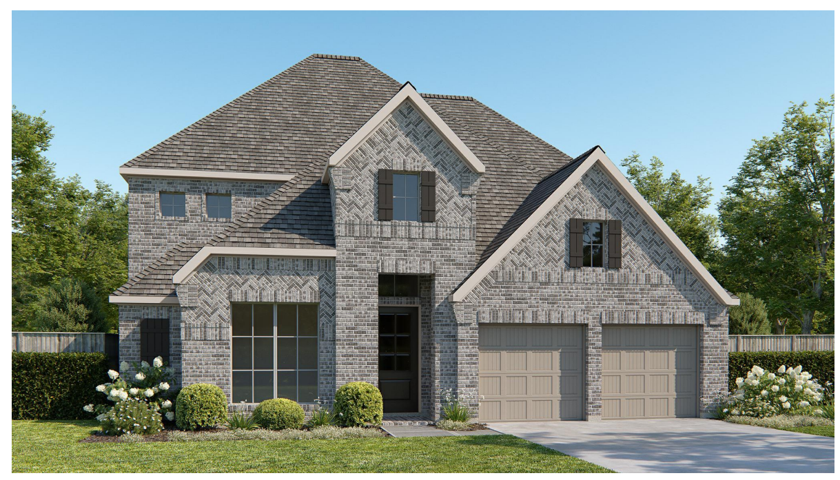
DESIGN 3397W E-1