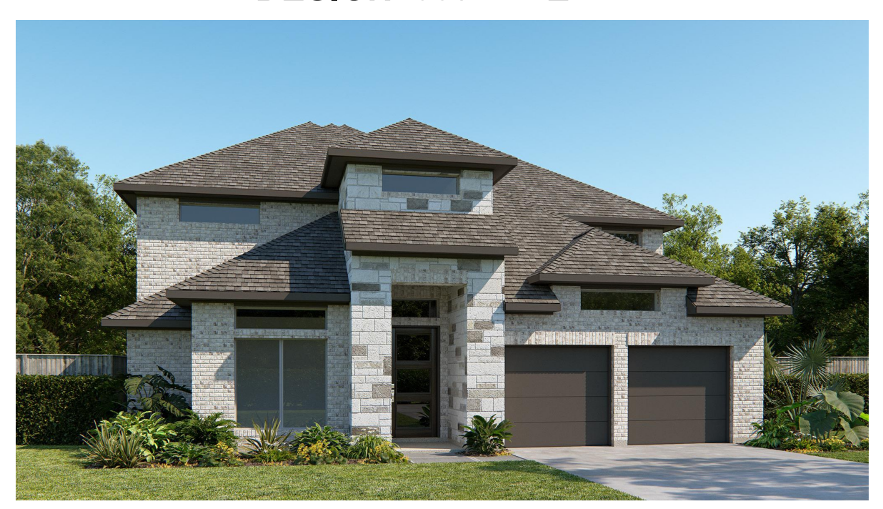
DESIGN 3397W E-70