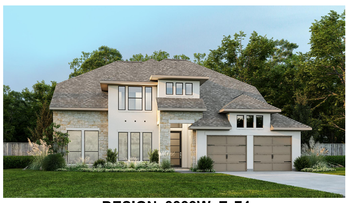
DESIGN 3399W E-74