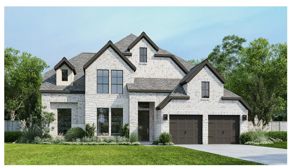
DESIGN 3399W E-53