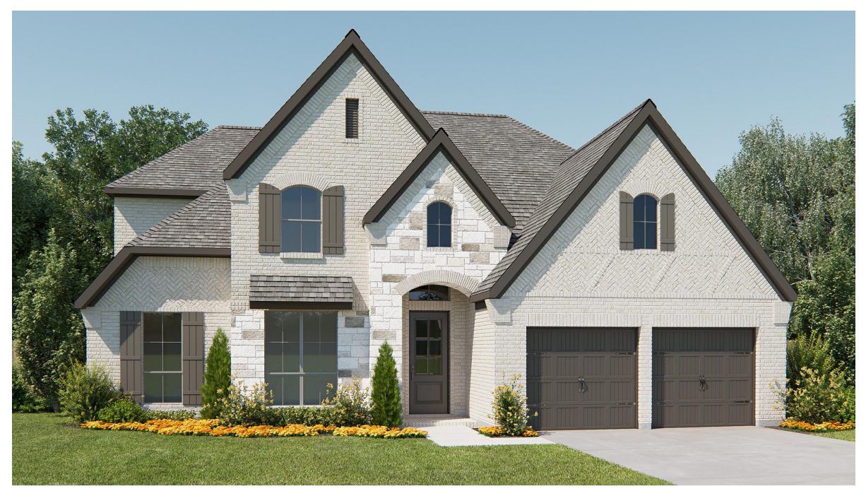
DESIGN 3399W E-50