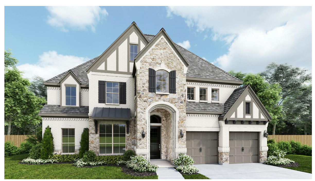
DESIGN 3399W E-100

This design, as originally designed and prior to any changes you make, is estimated to yield approximately the number of square feet shown on page 1. All dimensions are approximate. Square footage ma vary based on as-built dimensions, configurations, plan options and/or the method of calculation. Designs are not-to-scale, and are conceptual illustrations that may differ from construction plans or completed improvements. A design may depict features not available on all homesites or in all communities. Perry Homes reserves the right to make changes in plans and specifications, and to substitute material or similar quality. Prices, terms, promotions, plans, dimensions, features, options, amenities, elevations, designs, square footages, specifications, materials, and availability of homes or communities are subject to change without notice or obligation. All obligations will be governed by a written contract. This design does not constitute a commitment to build a particular floor plan or home in any given community. Some floor plans, options, and/or elevations may not be available on certain homesites or in a particular community and may require additional charges. Please check with Perry Homes to verify current offerings in the communities you are considering. This rendering is the property of Perry Homes, LLC. Any reproduction or exhibition is strictly prohibited. Perry Homes, LLC 2023