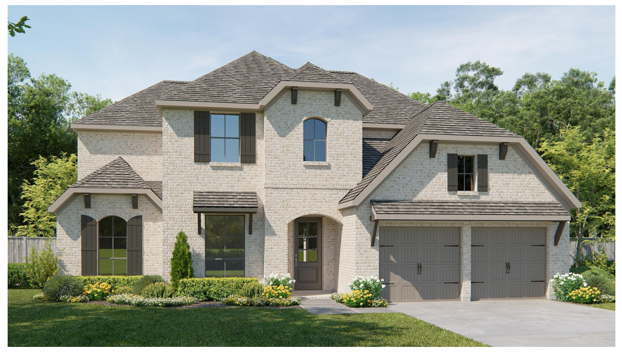
DESIGN 3399W E-1