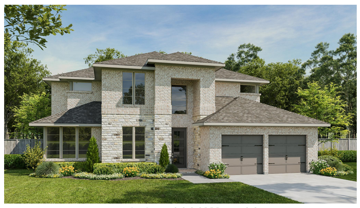
DESIGN 3399W E-32