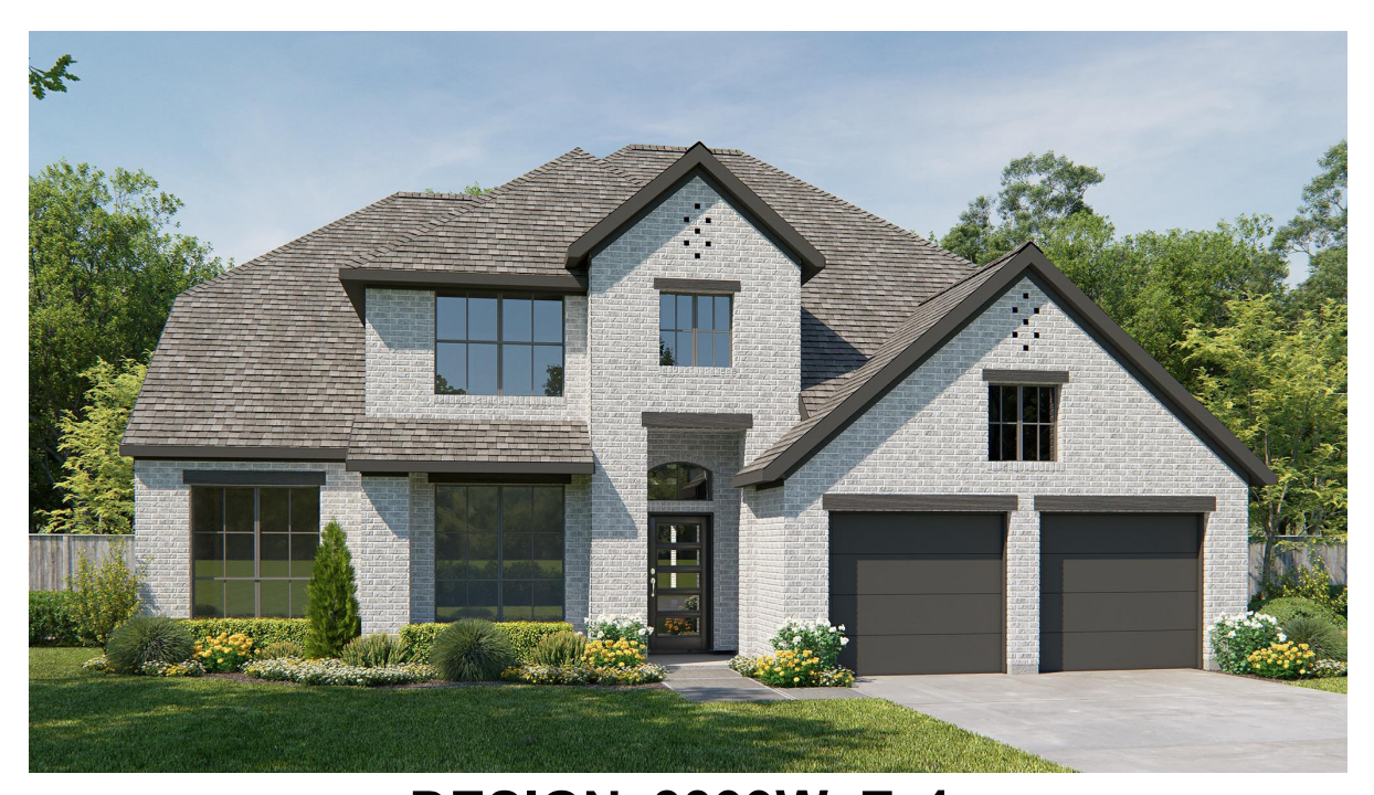
DESIGN 3399W E-4