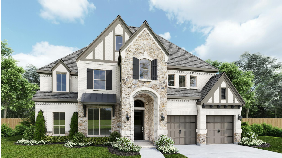
DESIGN 3399W E-100

This design, as originally designed and prior to any changes you make, is estimated to yield approximately the number of square feet shown on page 1. All dimensions are approximate. Square footage may vary based on as-built dimensions, configurations, plan options and/or the method of calculation. Designs are not-to-scale, and are conceptual illustrations that may differ from construction plans or completed improvements. A design may depict features not available on all homesites or in all communities. Perry Homes reserves the right to make changes in plans and specifications, and to substitute material of similar quality. Prices, terms, promotions, plans, dimensions, features, options, amenities, elevations, designs, square footages, specifications, materials, and availability of homes or communities are subject to change without notice or obligation. All obligations will be governed by a written contract. This design does not constitute a commitment to build a particular floor plan or home in any given community. Some floor plans, options, and/or elevations may not be available on certain homesites or in a particular community and may require additional charges. Please check with Perry Homes to verify current offerings in the communities you are considering. This rendering is the property of Perry Homes, LLC. Any reproduction or exhibition is strictly prohibited. © Perry Homes, LLC 2023