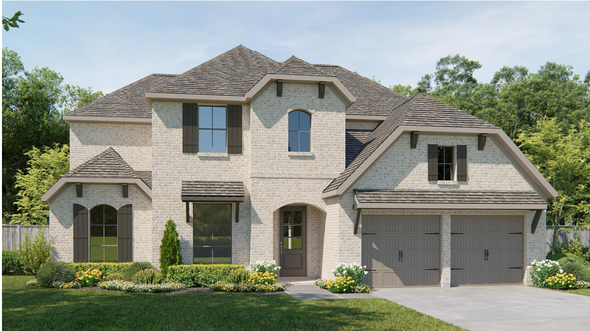
DESIGN 3399W E-1