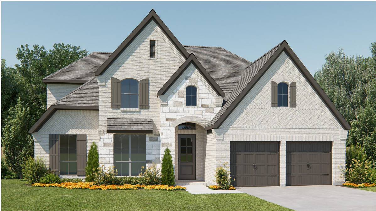
DESIGN 3399W E-50