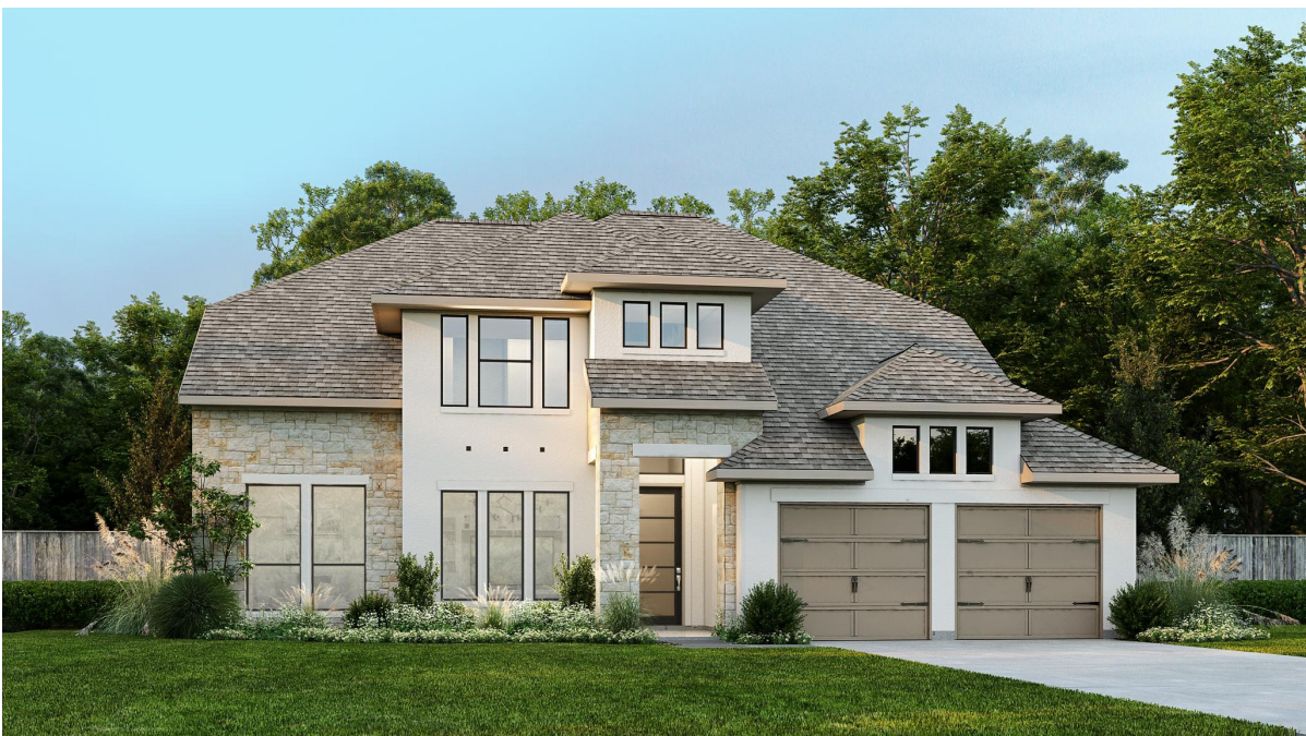
DESIGN 3399W E-74