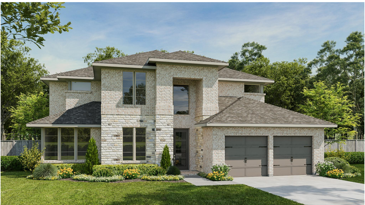
DESIGN 3399W E-32