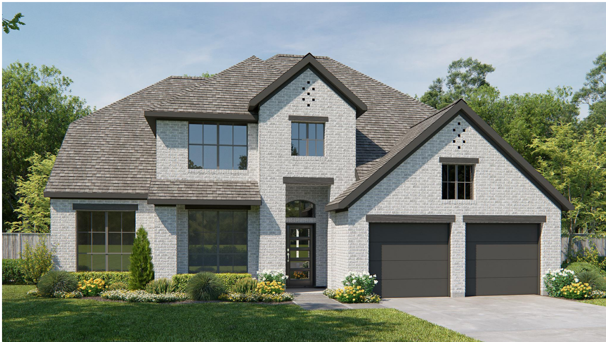
DESIGN 3399W E-4