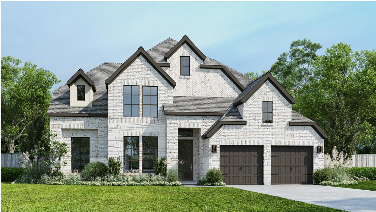
DESIGN 3399W E-53