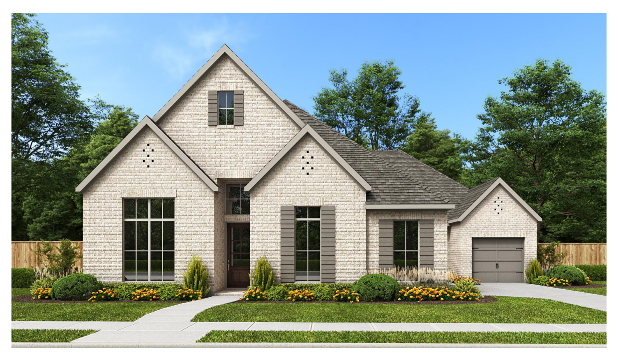
DESIGN 3433W E-1