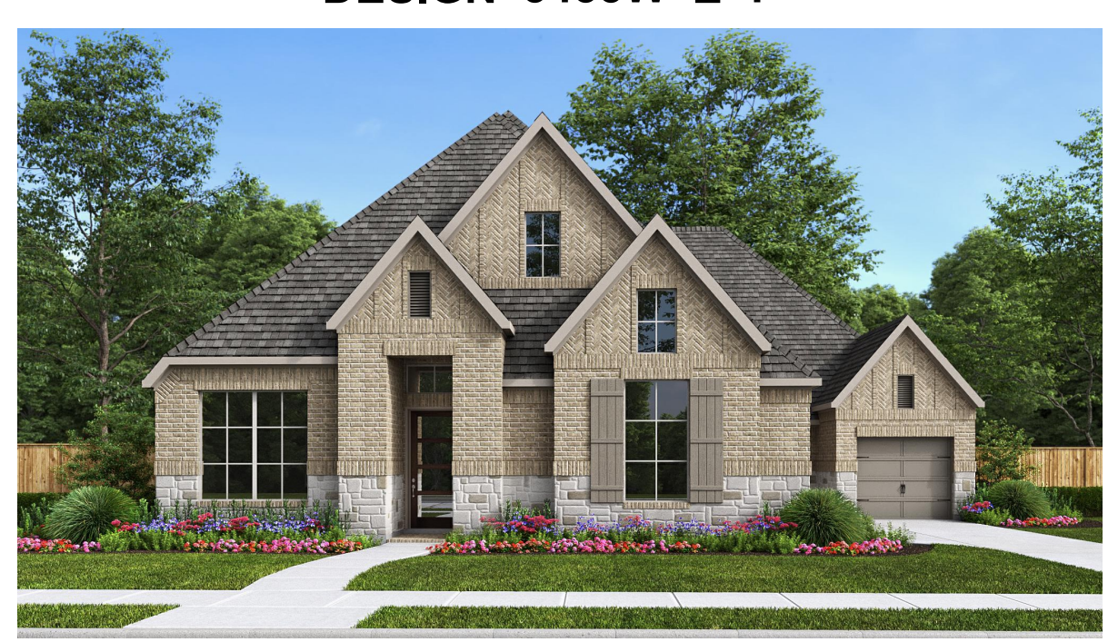
DESIGN 3433W E-50