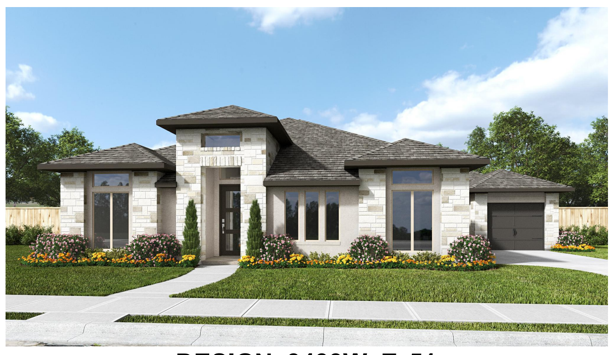
DESIGN 3433W E-51

This design, as originally designed and prior to any changes you make, is estimated to yield approximately the number of square feet shown on page 1. All dimensions are approximate. Square footage may vary based on as-built dimensions, configurations, plan options and/or the method of calculation. Designs are not-to-scale, and are conceptual illustrations that may differ from construction plans or completed improvements. A design may depict features not available on all homesites or in all communities. Perry Homes reserves the right to make changes in plans and specifications, and to substitute material of similar quality. Prices, terms, promotions, plans, dimensions, features, options, amenities, elevations, designs, square footages, specifications, materials, and availability of homes or communities are subject to change without notice or obligation. All obligations will be governed by a written contract. This design does not constitute a commitment to build a particular floor plan or home in any given community of the property of perry Homes. LLC and may require additional charges. Please check with Perry Homes to verify current offerings in the communities you are considering. This rendering is the property of Perry Homes. LLC. Any reproduction or exhibition is strictly prohibited. © Perry Homes. LLC 2023