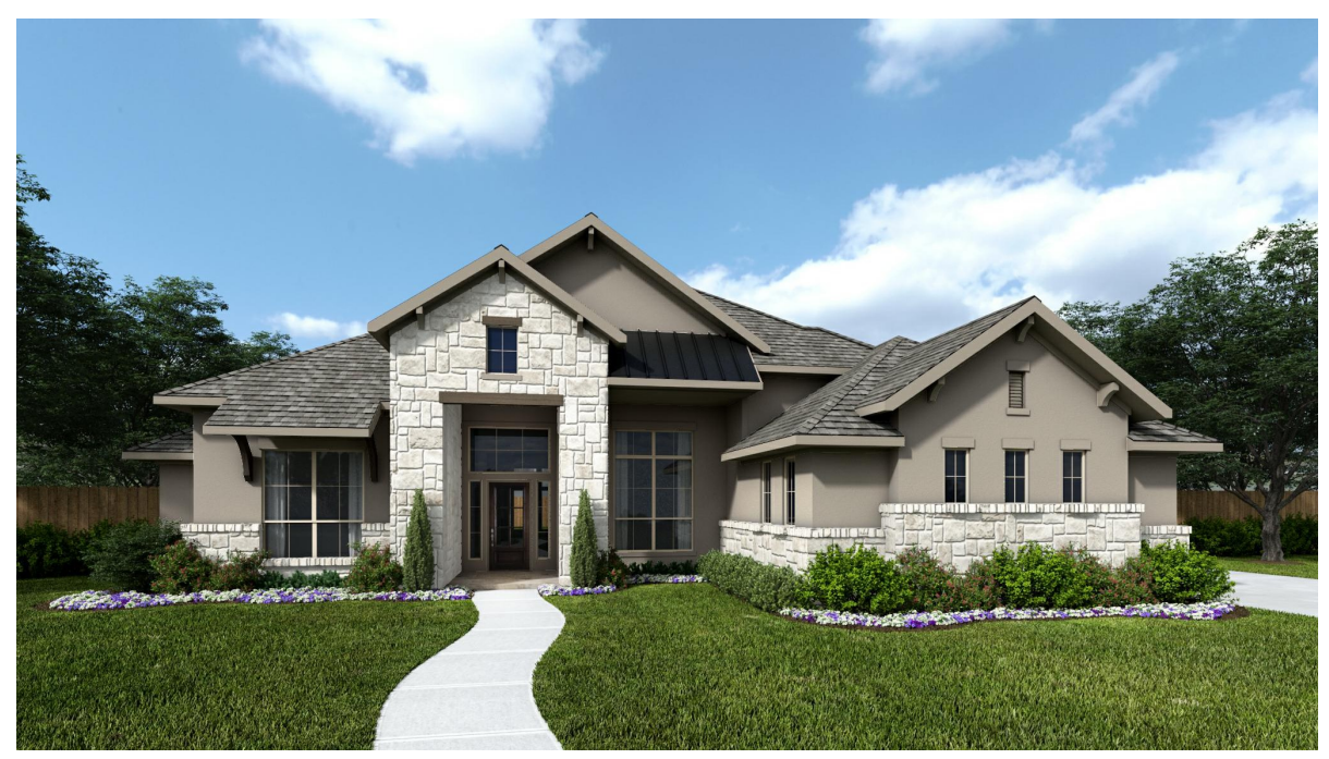
DESIGN 3435A E-1