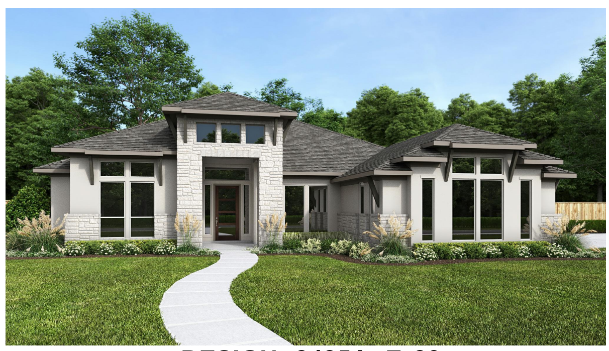
DESIGN 3435A E-30

This design, as originally designed and prior to any changes you make, is estimated to yield approximately the number of square feet shown on page 1. All dimensions are approximate. Square footage may vary based on as-built dimensions, configurations, plan options and/or the method of calculation. Designs are not-to-scale, and are conceptual illustrations that may differ from construction plans or completed improvements. A design may depict features not available on all homesites or in all communities. Perry Homes reserves the right to make changes in plans and specifications, and to substitute material of similar quality. Prices, terms, promotions, plans, dimensions, features, options, amenities, elevations, designs, square footages, specifications, materials, and availability of homes or communities are subject to change without notice or obligation. All obligations will be governed by a written contract. This design does not constitute a commitment to build a particular floor plan or home in any given community Some floor plans, options, and/or elevations may not be available on certain homesites or in a particular community and may require additional charges. Please check with Perry Homes to verify current offerings in the communities are considering. This rendering is the property of Perry Homes. LLC. Any reproduction or exhibition is strictly prohibited @ Perry Homes LLC. 2020.