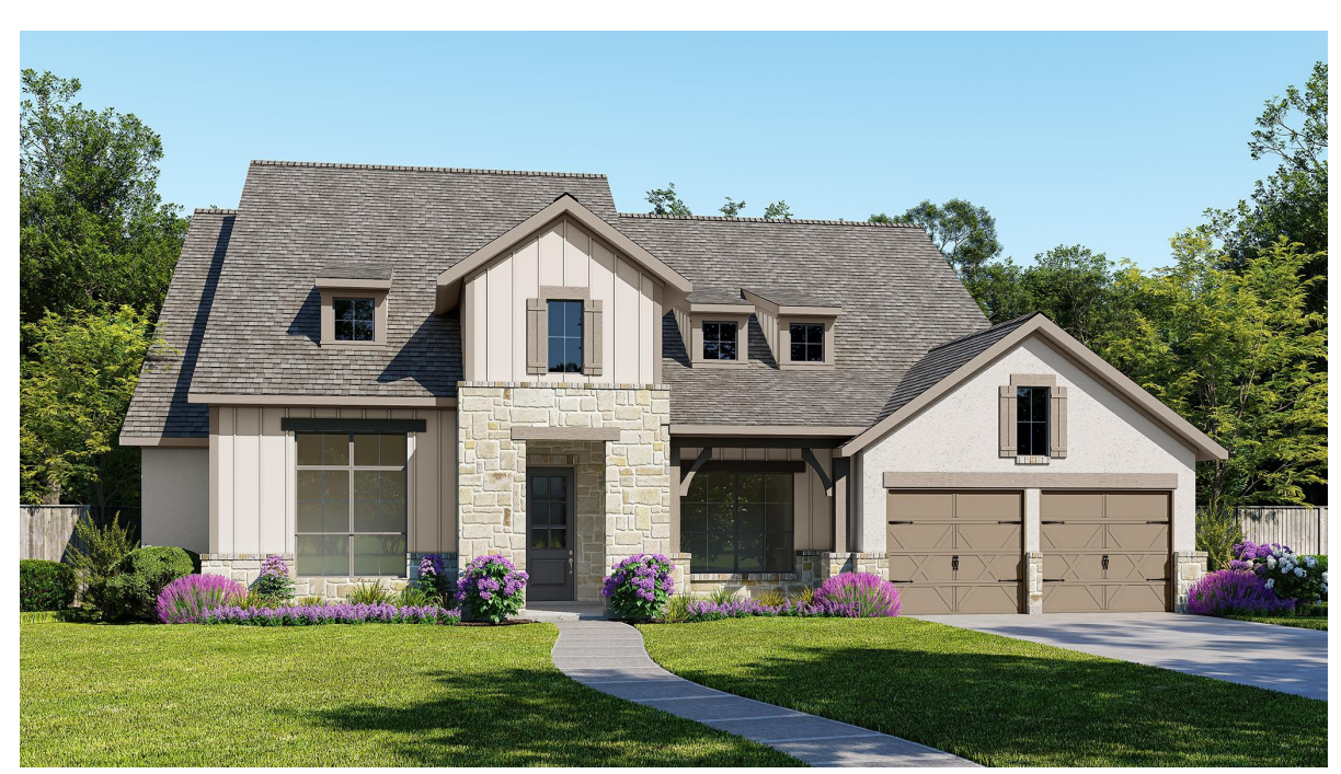
DESIGN 3435S E-50

Inis design, as originally designed and prior to any changes you make, is estimated to yield approximately the number of square feet shown on page 1. All dimensions are approximatels. Square footage may vary based on as-built dimensions, configurations, plan options and/or the method of calculation. Designs are not-to-scale, and are conceptual illustrations that may differ from construction plans or completed improvements. A design may depict features not available on all homesites or in all communities. Perry Homes reserves the right to make changes in plans and specifications, and to substitute material original and availability of homes or communities, are subject to change without notice or obligation. All obligations will be governed by a written contract. This design does not constitute a commitment to build a particular floor plan or home in any given community. Some floor plans, options, and/or elevations may not be available on certain homesites or in a particular community and may require additional charges. Please check with Perry Homes to verify current offerings in the communities you are considering. This rendering is the property of Perry Homes, LLC. Any reproduction or exhibition is strictly prohibited. © Perry Homes, LLC 2024