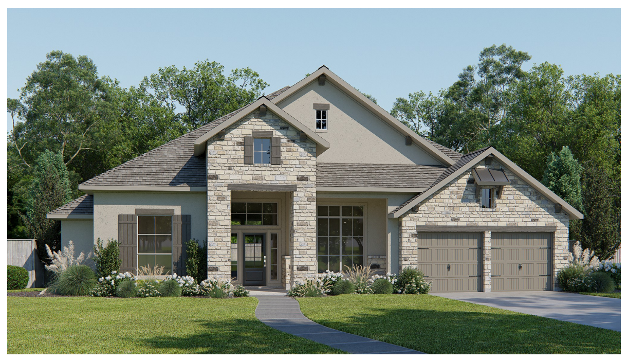
DESIGN 3435S E-1