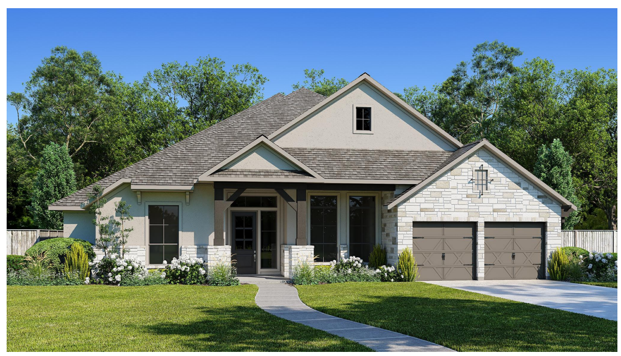
DESIGN 3435S E-2