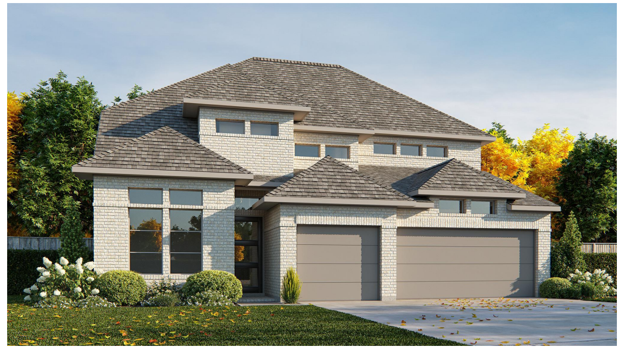
DESIGN 3445W E-1