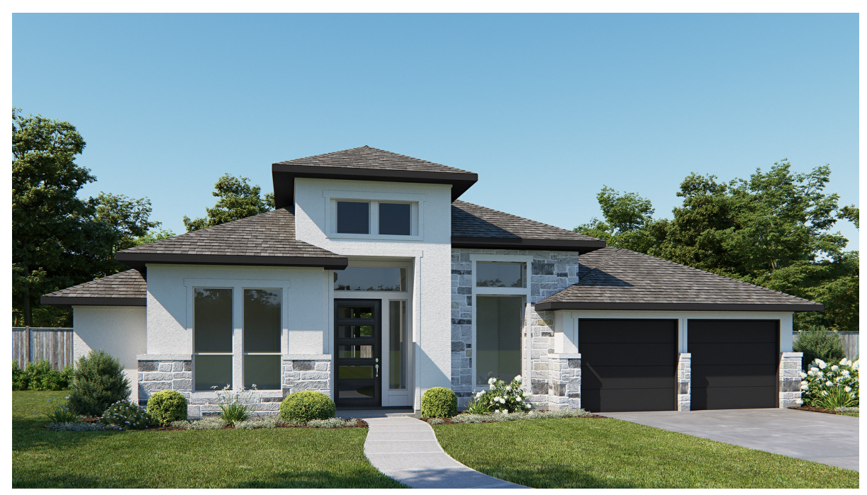
DESIGN 3465W E-59