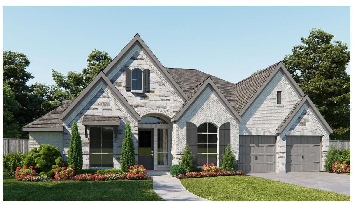
DESIGN 3465W E-70

This design, as originally designed and prior to any changes you make, is estimated to yield approximately the number of square feet shown on page 1. All dimensions are approximate. Square footage may vary based on as-built dimensions, configurations, plan options and/or the method of calculation. Designs are not-to-scale, and are conceptual illustrations that may differ from construction plans or completed improvements. A design may depict features not available on all homesites or in all communities. Perry Homes reserves the right to make changes in plans and specifications, and to substitute material of similar quality. Prices, terms, promotions, plans, dimensions, features, options, amenities, elevations, designs, square footages, specifications, materials, and availability of homes or communities to change without notice or obligation. All obligations will be governed by a written contract. This design does not constitute a commitment to build a particular floor plan or home in any given community. Some floor plans, options, and/or elevations may not be available on certain homesites or in a particular community and may require additional charges. Please check with Perry Homes to verify current offerings in the communities and are considering. This rendering is the property of Perry Homes. LLC. Any reproduction or exhibition is strictly prohibited @ Perry Homes LLC. 2013