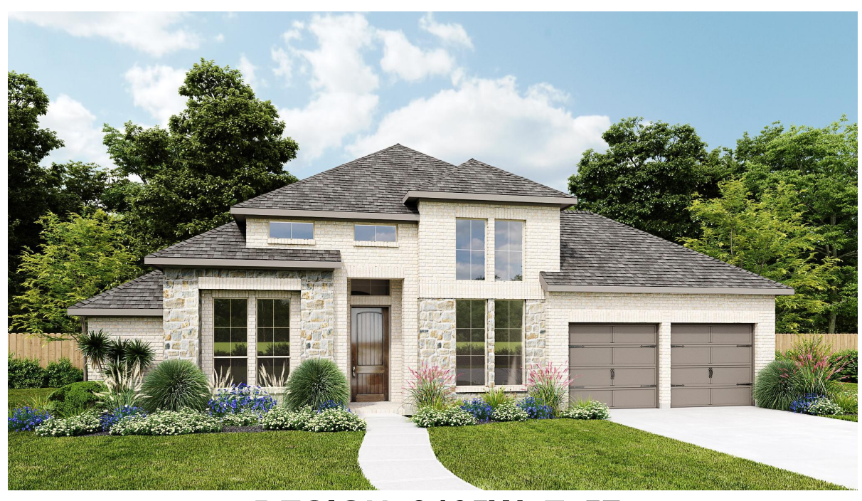
DESIGN 3465W E-57