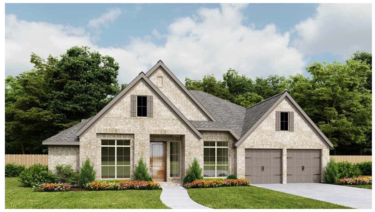
DESIGN 3465W E-1