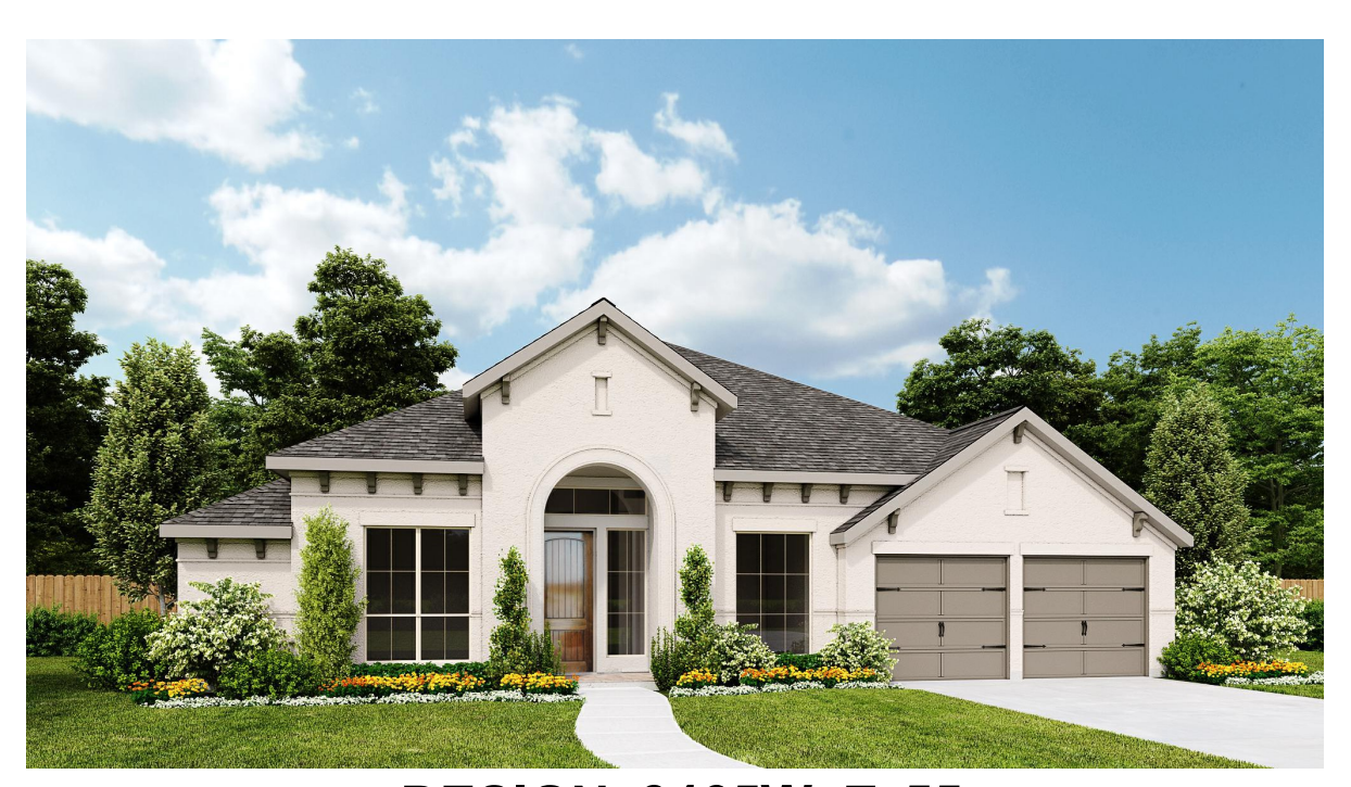
DESIGN 3465W E-55