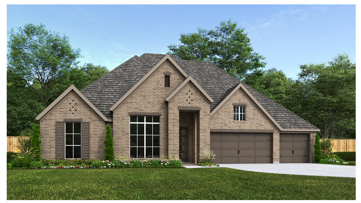
DESIGN 3469W E-1