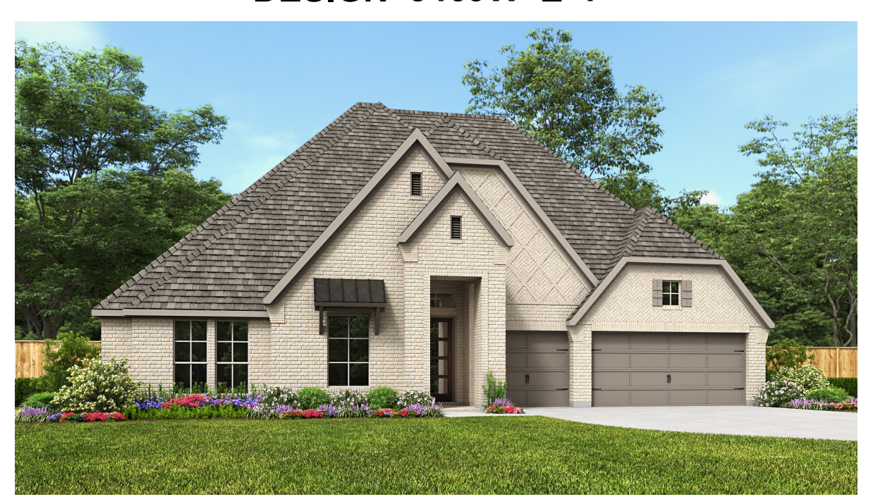
DESIGN 3469W E-51