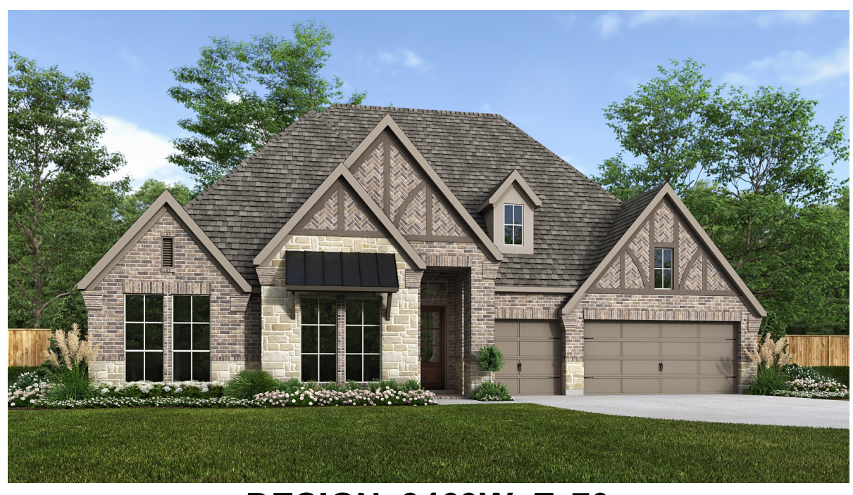
DESIGN 3469W E-70

This design, as originally designed and prior to any changes you make, is estimated to yield approximately the number of square feet shown on page 1. All dimensions are approximate. Square footage may vary based on as-built dimensions, configurations, plan options and/or the method of calculation. Designs are not-to-scale, and are conceptual illustrations that may differ from construction plans or completed improvements. A design may depict features not available on all homesites or in all communities. Perry Homes reserves the right to make changes in plans and specifications, and to substitute material of similar quality. Prices, terms, promotions, plans, dimensions, features, options, amenities, elevations, designs, square footages, specifications, materials, and availability of homes or communities to change without notice or obligation. All obligations will be governed by a written contract. This design does not constitute a commitment to build a particular floor plan or home in any given community. Some floor plans, options, and/or elevations may not be available on certain homesites or in a particular community and may require additional charges. Please check with Perry Homes to verify current offerings in the communities on a green considering. This rendering is the property of Perry Homes. LLC. Any reproduction or exhibition is strictly prohibited @ Perry Homes LLC. 2018