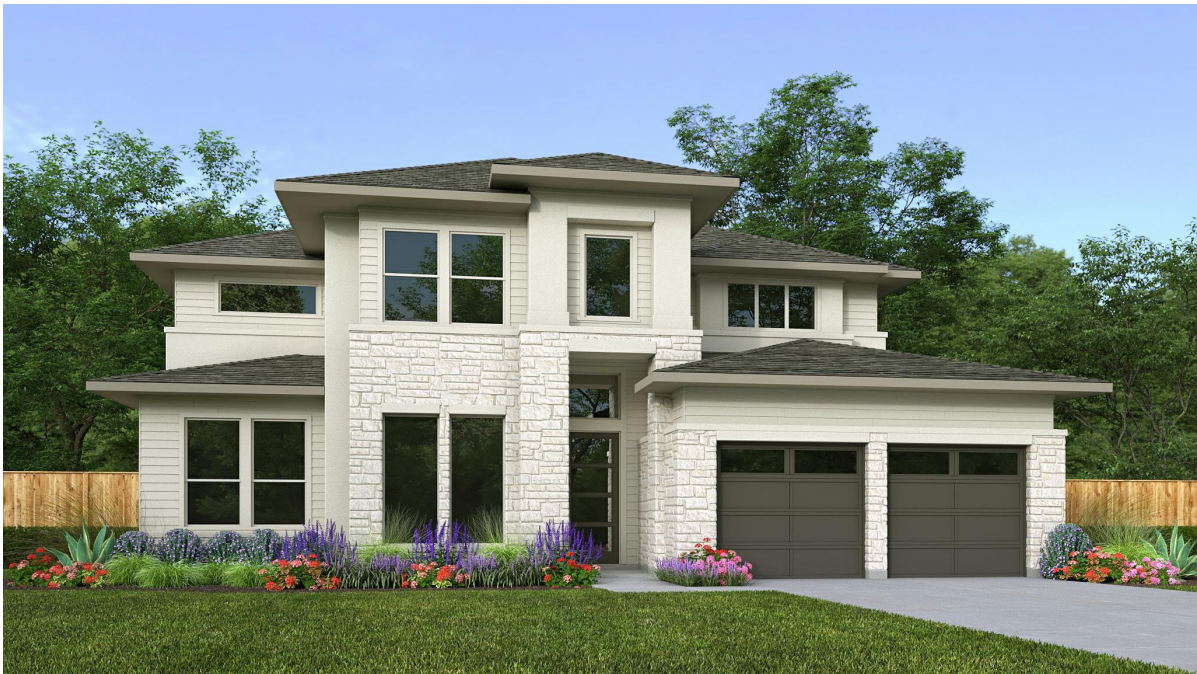
DESIGN 3491E E-50