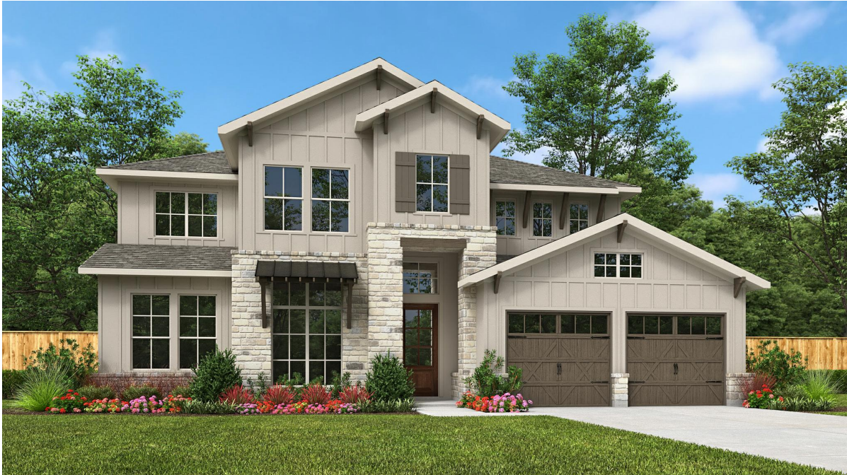
DESIGN 3491E E-1