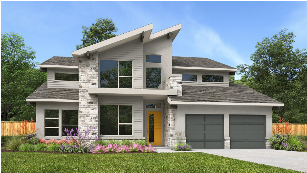
DESIGN 3491E E-70

This design, as originally designed and prior to any changes you make, is estimated to yield approximately the number of square feet shown on page 1. All dimensions are approximate. Square footage may vary based on as-built dimensions, configurations, plan options and/or the method of calculation. Designs are not-to-scale, and are conceptual illustrations that may differ from construction plans or completed improvements. A design may depict features not available on all homesites or in all communities. Perry Homes reserves the right to make changes in plans and specifications, and to substitute material of similar quality. Prices, terms, promotions, plans, dimensions, features, options, amenities, elevations, designs, square footages, specifications, materials, and availability of homes or communities are subject to change without notice or obligation. All obligations will be governed by a written contract. This design does not constitute a commitment to build a particular floor plan or home in any given community. Some floor plans, options, and/or elevations may not be available on certain homesites or in a particular community and may require additional charges. Please check with Perry Homes to verify current offerings in the communities you are considering. This rendering is the property of Perry Homes, LLC. Any reproduction or exhibition is strictly prohibited. © Perry Homes, LLC 2024