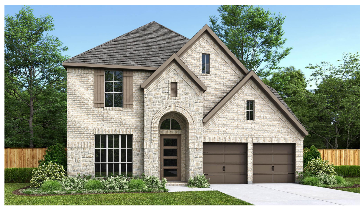
DESIGN 3500W E-50