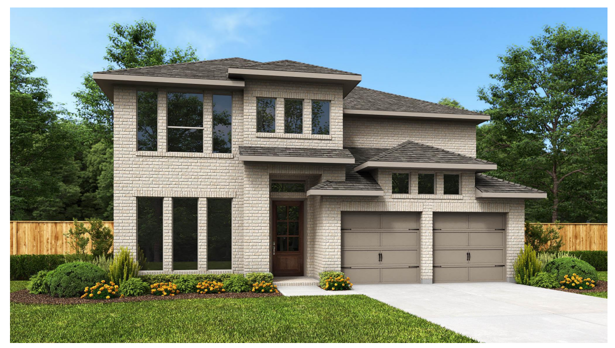
DESIGN 3500W E-1