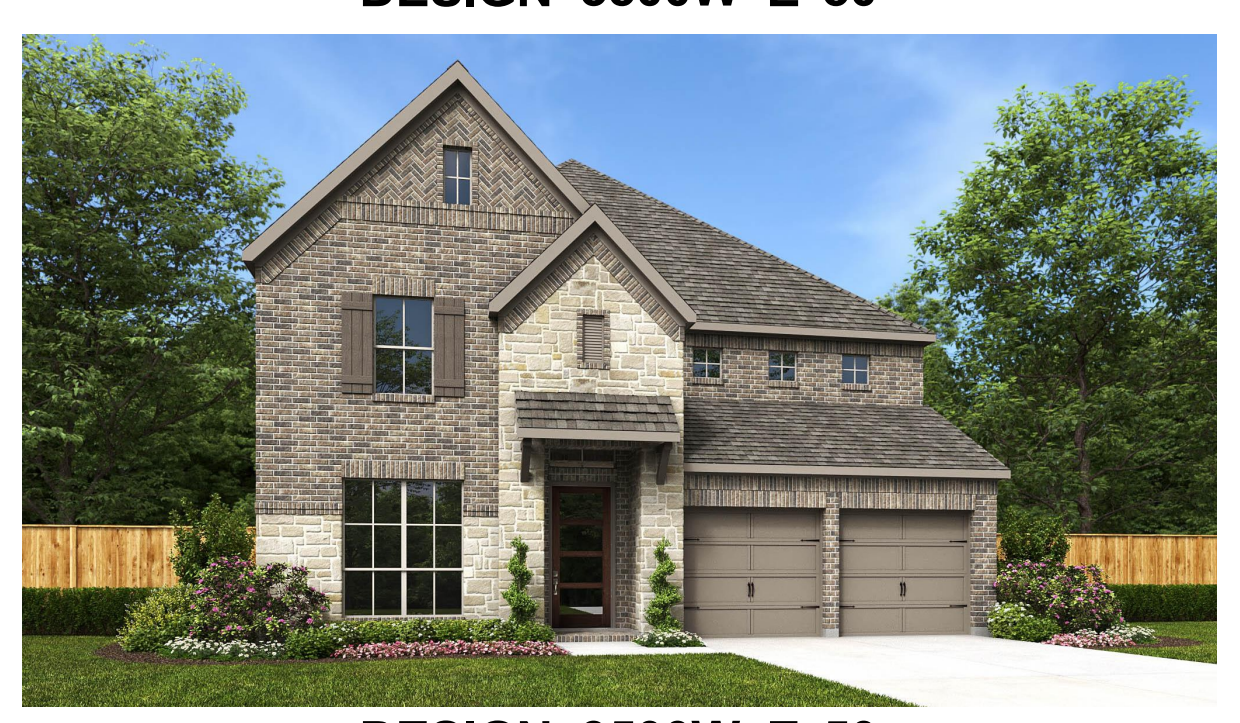
DESIGN 3500W E-50

This design, as originally designed and prior to any changes you male, is stime, 'tell to 'i i i i i approximate') the land to see a should dimensions, configurations, plan options and/or the interned of staticulation. Lestignis are not-to-scale, and are conceptual illustrations that may differ from construction plans or completed improvements. A design may depict features not available on all homesites or in all communities. Perry Homes reserves the right to make changes in plans and specifications, and to substitute material of similar quality. Prices, terms, promotions, plans, dimensions, features, options, amenities, elevations, designs, square footages, specifications, materials, and availability of homes or communities to change without notice or obligation. All obligations will be governed by a written contract. This design does not constitute a commitment to build a particular floor plan or home in any given community. Some floor plans, options, and/or elevations may not be available on certain homesites or in a particular community and may require additional charges. Please check with Perry Homes to verify current offerings in the communities volume considering. This rendering is the property of Perry Homes. LLC. Any reproduction or exhibition is strictly prohibited (@ Perry Homes LLC. 2022)