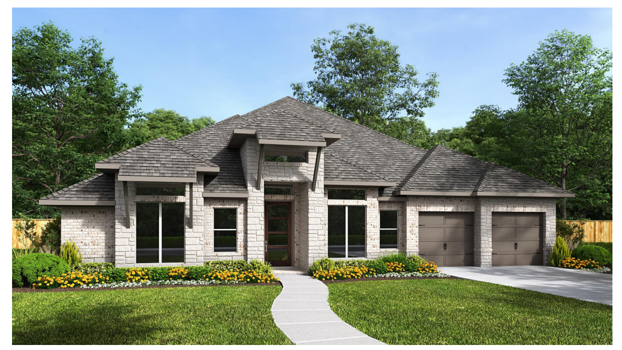
DESIGN 3525W E-32