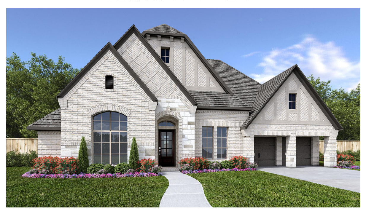
DESIGN 3525W E-100