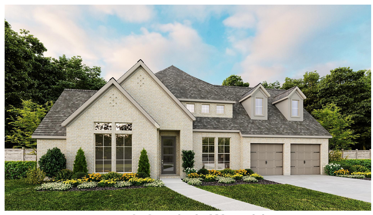
DESIGN 3525W E-31