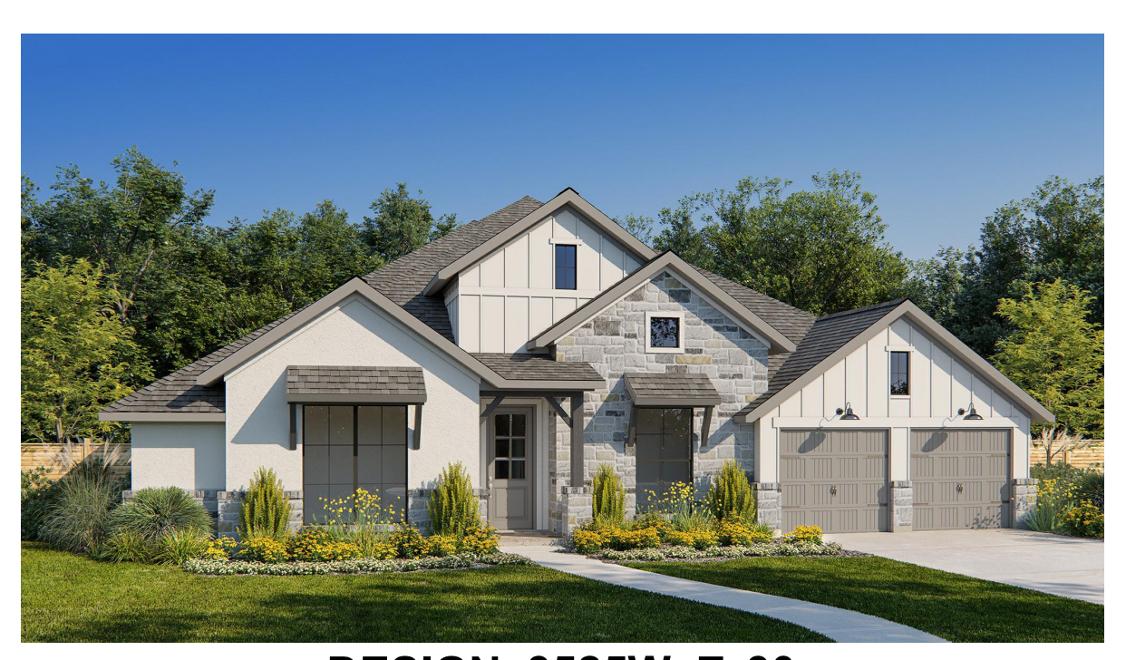
DESIGN 3525W E-30