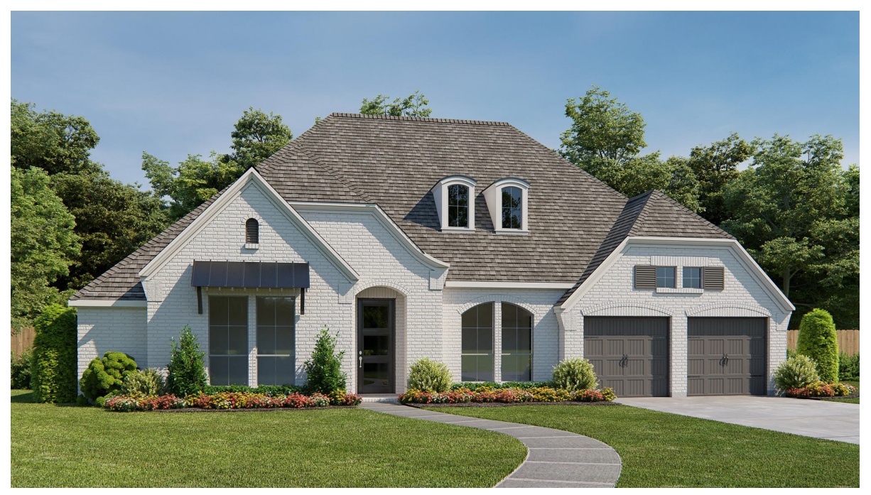
DESIGN 3525W E-1