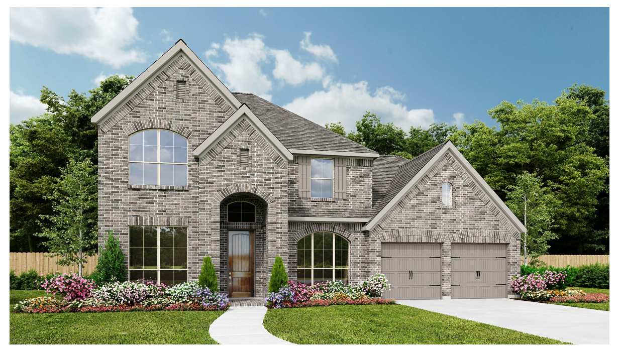
DESIGN 3546W E-1