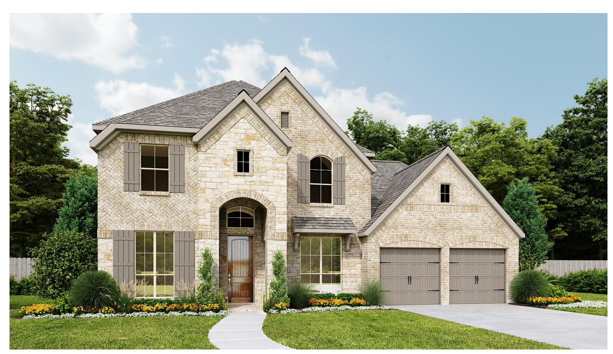
DESIGN 3546W E-70