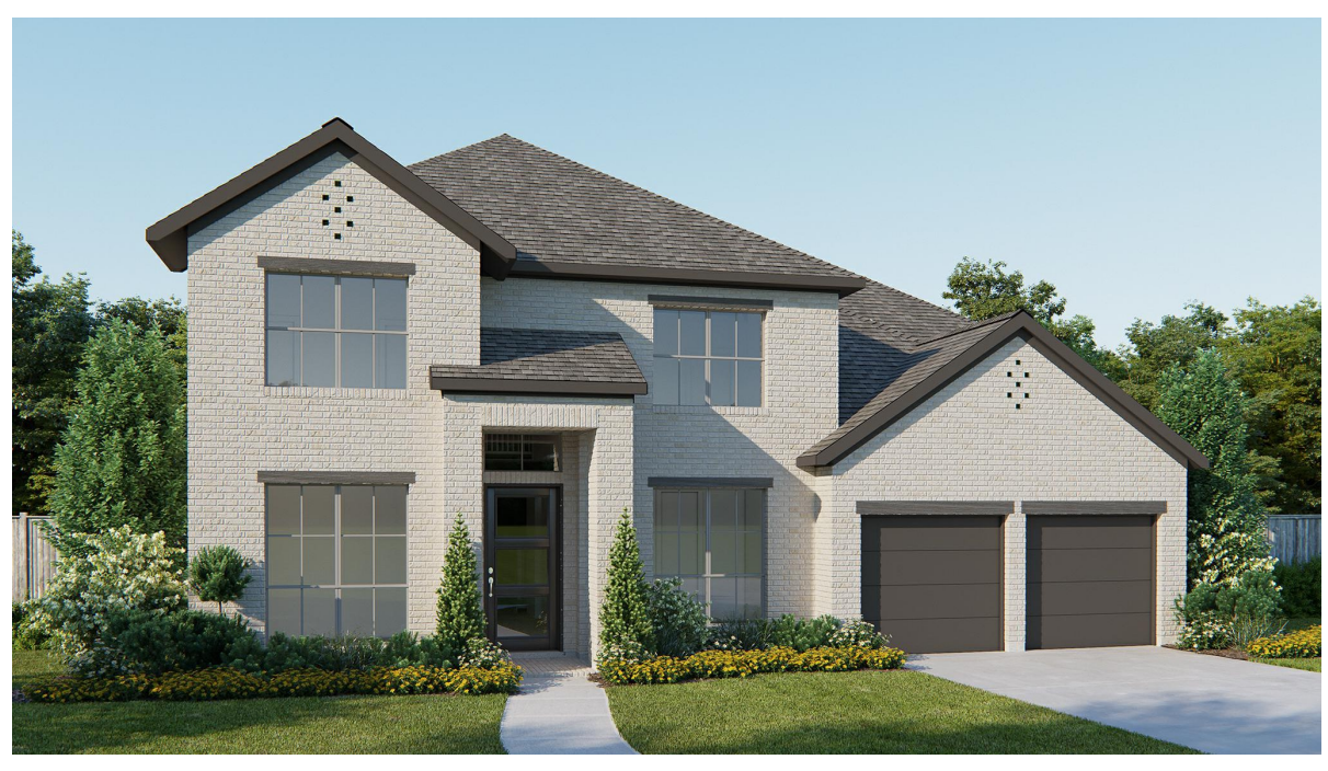
DESIGN 3546W E-32