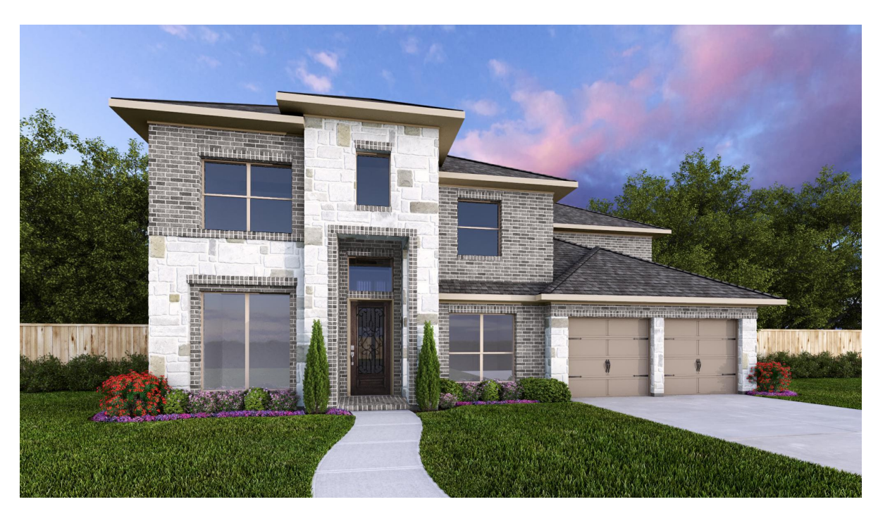
DESIGN 3546W E-31