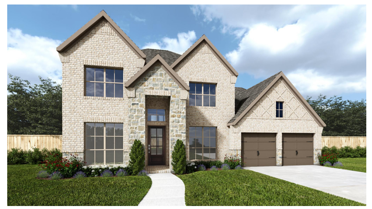
DESIGN 3546W E-51