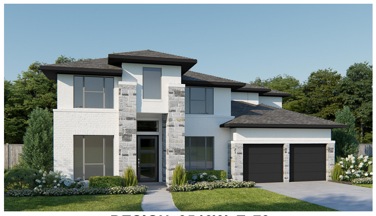
DESIGN 3546W E-73

This design, as originally designed and prior to any changes you make, is estimated to yield approximately the number of square feet shown on page 1. All dimensions are approximate. Square footage may vary based on as-built dimensions, configurations, plan options and/or the method of calculation. Designs are not-to-scale, and are conceptual illustrations that may differ from construction plans or completed improvements. A design may depict features not available on all homesites or in all communities. Perry Homes reserves the right to make changes in plans and specifications, and to substitute material of similar quality. Prices, terms, promotions, plans, dimensions, features, options, amenities, elevations, designs, square footages, specifications, materials, and availability of homes or communities to change without notice or obligation. All obligations will be governed by a written contract. This design does not constitute a commitment to build a particular floor plan or home in any given community. Some floor plans, options, and/or elevations may not be available on certain homesites or in a particular community and may require additional charges. Please check with Perry Homes to verify current offerings in the communities on are considering. This rendering is the property of Perry Homes. LLC. Any reproduction or exhibition is strictly prohibited @ Perry Homes LLC. 2018