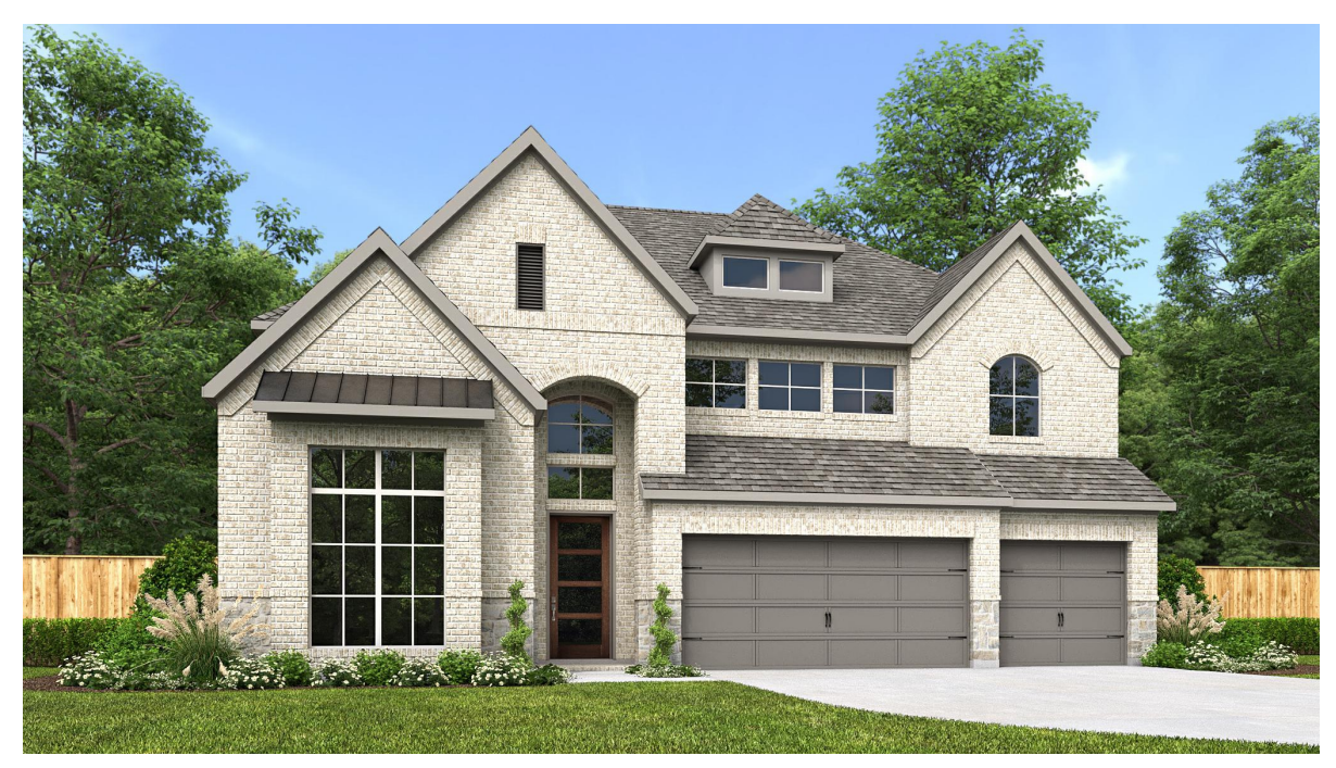
DESIGN 3550W E-1