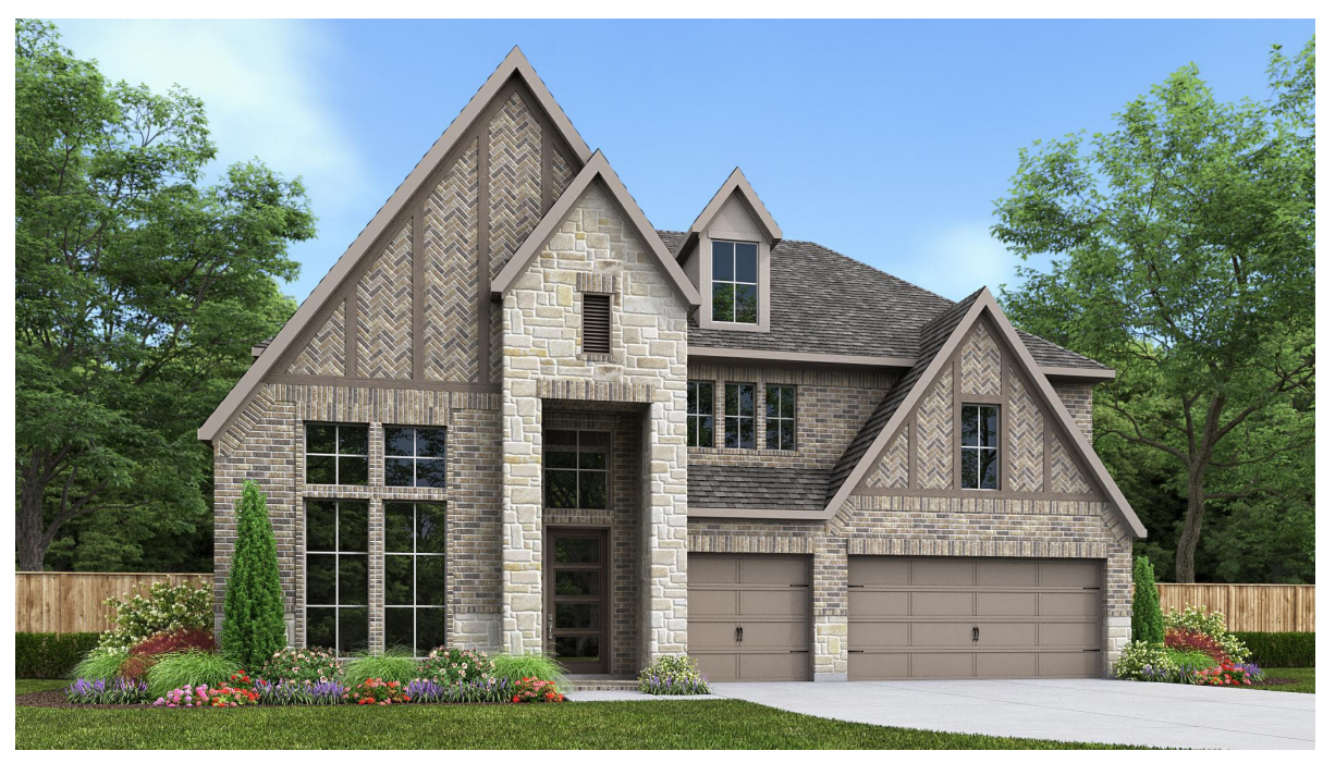
DESIGN 3550W E-90

This design, as originally designed and prior to any changes you make, is estimated to yield approximately the number of square feet shown on page 1. All dimensions are approximate. Square footage may vary based on as-built dimensions, configurations, plan options and/or the method of calculation. Designs are not-to-scale, and are conceptual illustrations that may differ from construction plans or completed improvements. A design may depict features not available on all homesites or in all communities. Perry Homes reserves the right to make changes in plans and specifications, and to substitute material of similar quality. Prices, terms, promotions, plans, dimensions, features, options, amenities, elevations, designs, square footages, specifications, materials, and availability of homes or communities are subject to change without notice or obligation. All obligations will be governed by a written contract. This design does not constitute a commitment to build a particular floor plan or home in any given community of the property of perry Homes. LLC and may require additional charges. Please check with Perry Homes to verify current offerings in the communities you are considering. This rendering is the property of Perry Homes. LLC. Any reproduction or exhibition is strictly prohibited. © Perry Homes. LLC 2022