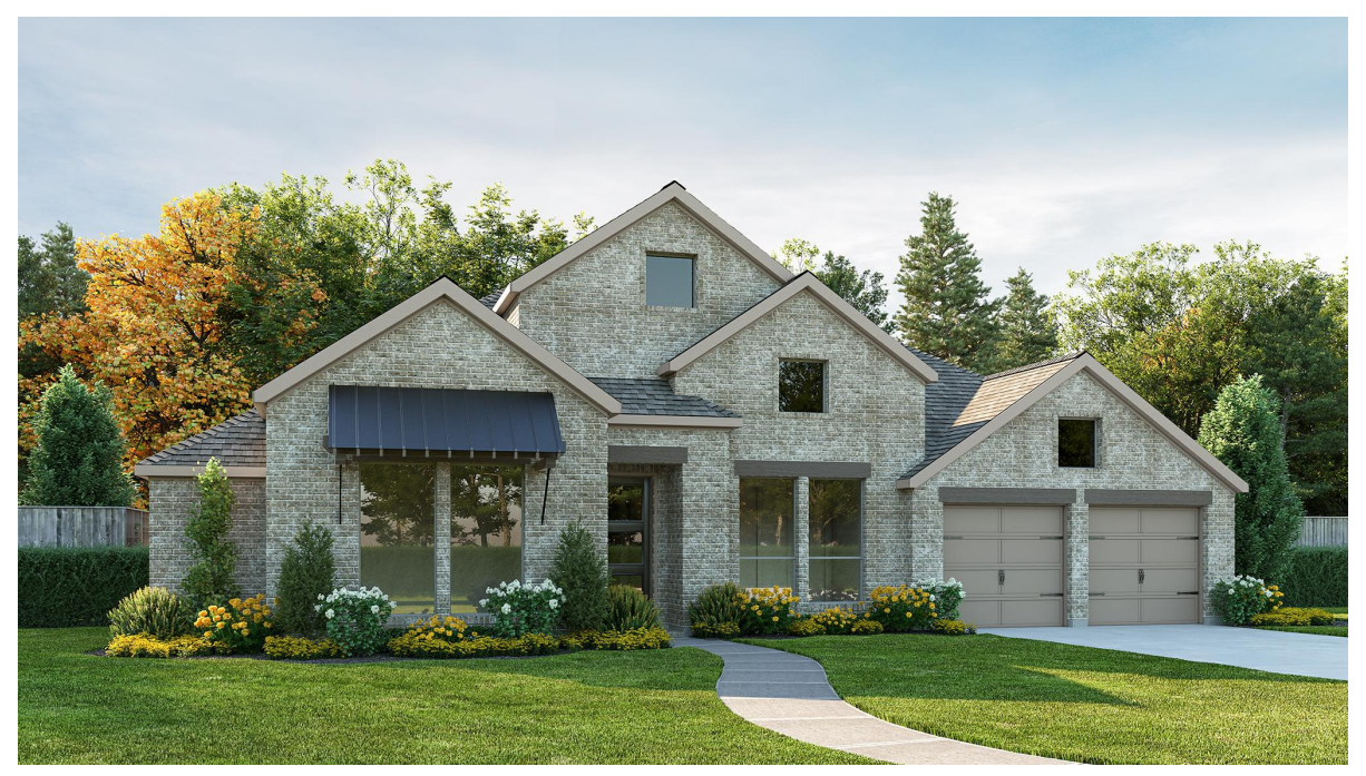
DESIGN 3566W E-1