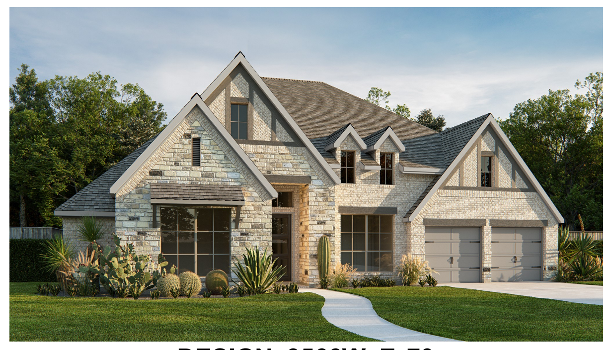
DESIGN 3566W E-70

This design, as originally designed and prior to any changes you make, is estimated to yield approximately the number of square feet shown on page 1. All dimensions are approximate. Square footage may vary based on as-built dimensions, configurations, plan options and/or the method of calculation. Designs are not-to-scale, and are conceptual illustrations that may differ from construction plans or completed improvements. A design may depict features not available on all homesites or in all communities. Perry Homes reserves the right to make changes in plans and specifications, and to substitute material of similar quality. Prices, terms, promotions, plans, dimensions, features, options, amenities, elevations, designs, square footages, specifications, materials, and availability of homes or communities to change without notice or obligation. All obligations will be governed by a written contract. This design does not constitute a commitment to build a particular floor plan or home in any given community. Some floor plans, options, and/or elevations may not be available on certain homesites or in a particular community and may require additional charges. Please check with Perry Homes to verify current offerings in the communities on a green considering. This rendering is the property of Perry Homes. LLC. Any reproduction or exhibition is strictly prohibited @ Perry Homes LLC. 2018