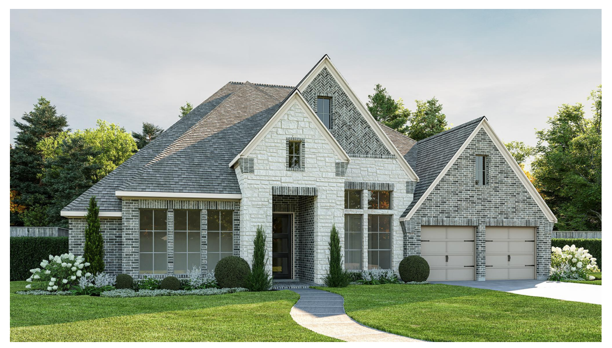
DESIGN 3566W E-50