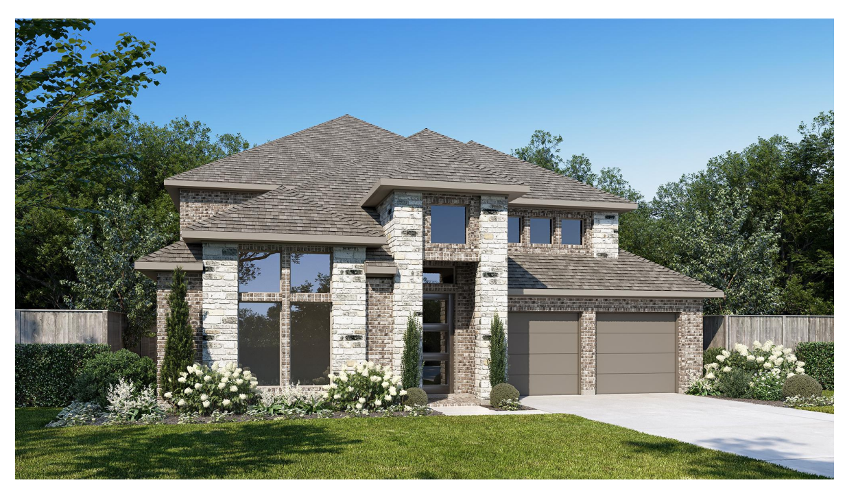
DESIGN 3573W E-70