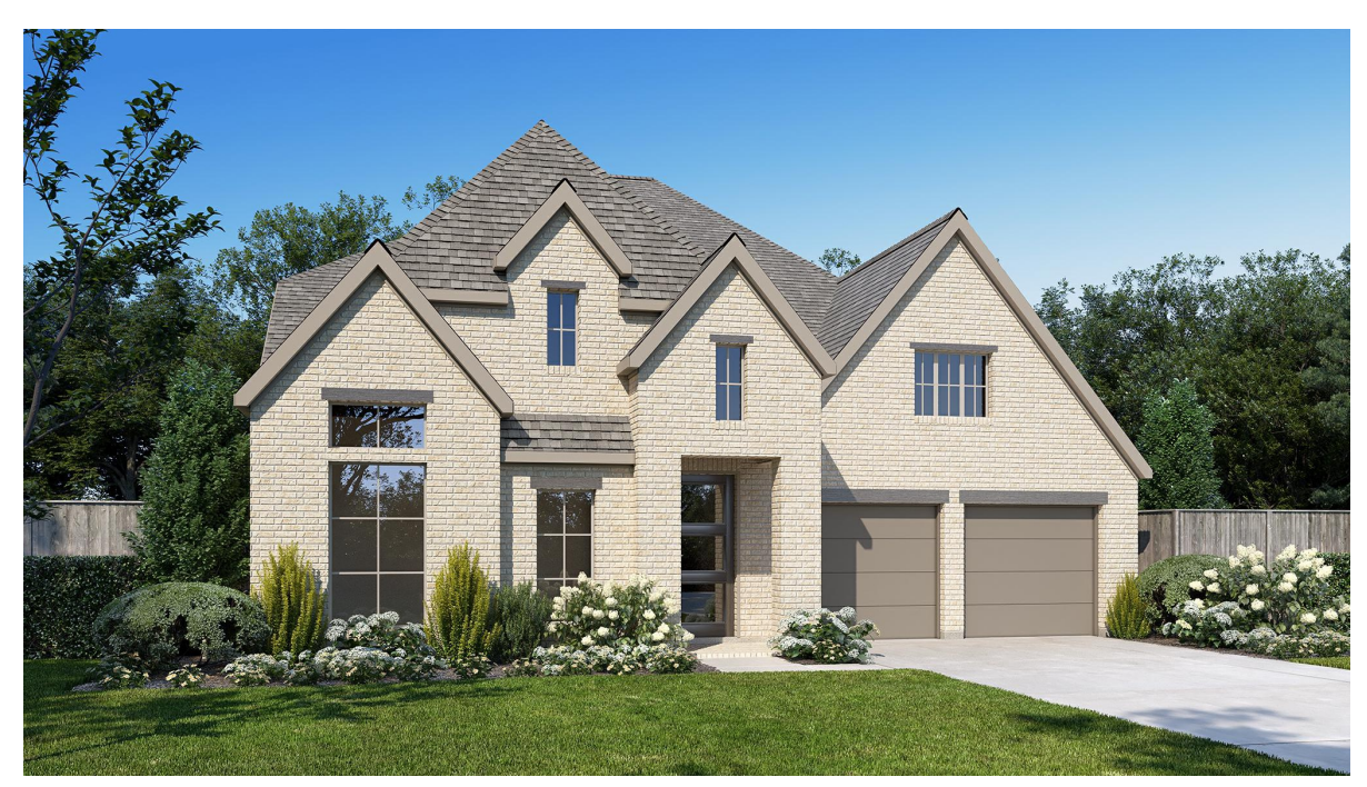
DESIGN 3573W E-1