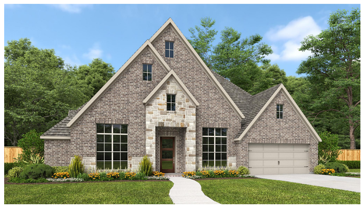
DESIGN 3578P E-72

This design, as originally designed and prior to any changes you make, is estimated to yield approximately the number of square feet shown on page 1. All dimensions are approximate. Square footage may vary based on as-built dimensions, configurations, plan options and/or the method of calculation. Designs are not-to-scale, and are conceptual illustrations that may differ from construction plans or completed improvements. A design may depict features not available on all homesites or in all communities. Perry Homes reserves the right to make changes in plans and specifications, and to substitute material of similar quality. Prices, terms, promotions, plans, dimensions, features, options, amenities, elevations, designs, square footages, specifications, materials, and availability of homes or communities are subject to change without notice or obligation. All obligations will be governed by a written contract. This design does not constitute a commitment to build a particular floor plan or home in any given community Some floor plans, options, and/or elevations may not be available on certain homesites or in a particular community and may require additional charges. Please check with Perry Homes to verify current offerings in the communities are considering. This rendering is the property of Perry Homes. LLC. Any reproduction or exhibition is strictly prohibited @ Perry Homes LLC. 2024