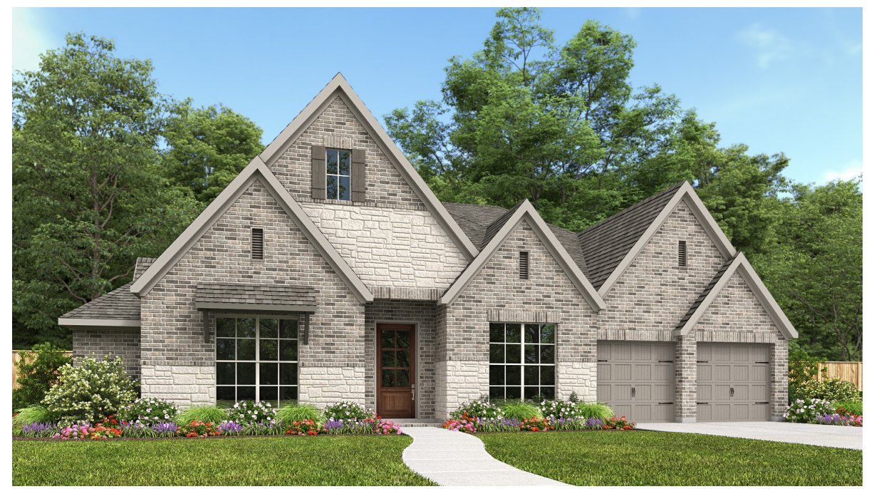
DESIGN 3578P E-1