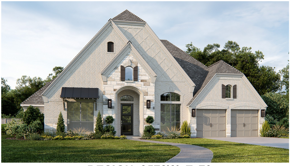
DESIGN 3578W E-70

*See Page 3 for Details and Disclaimers | © Perry Homes, LLC 2023 | 8/10/2023 5:44:53 PM (70' CL) PerryHomes.com