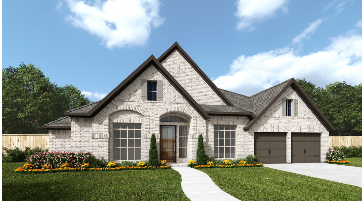
DESIGN 3578W E-1